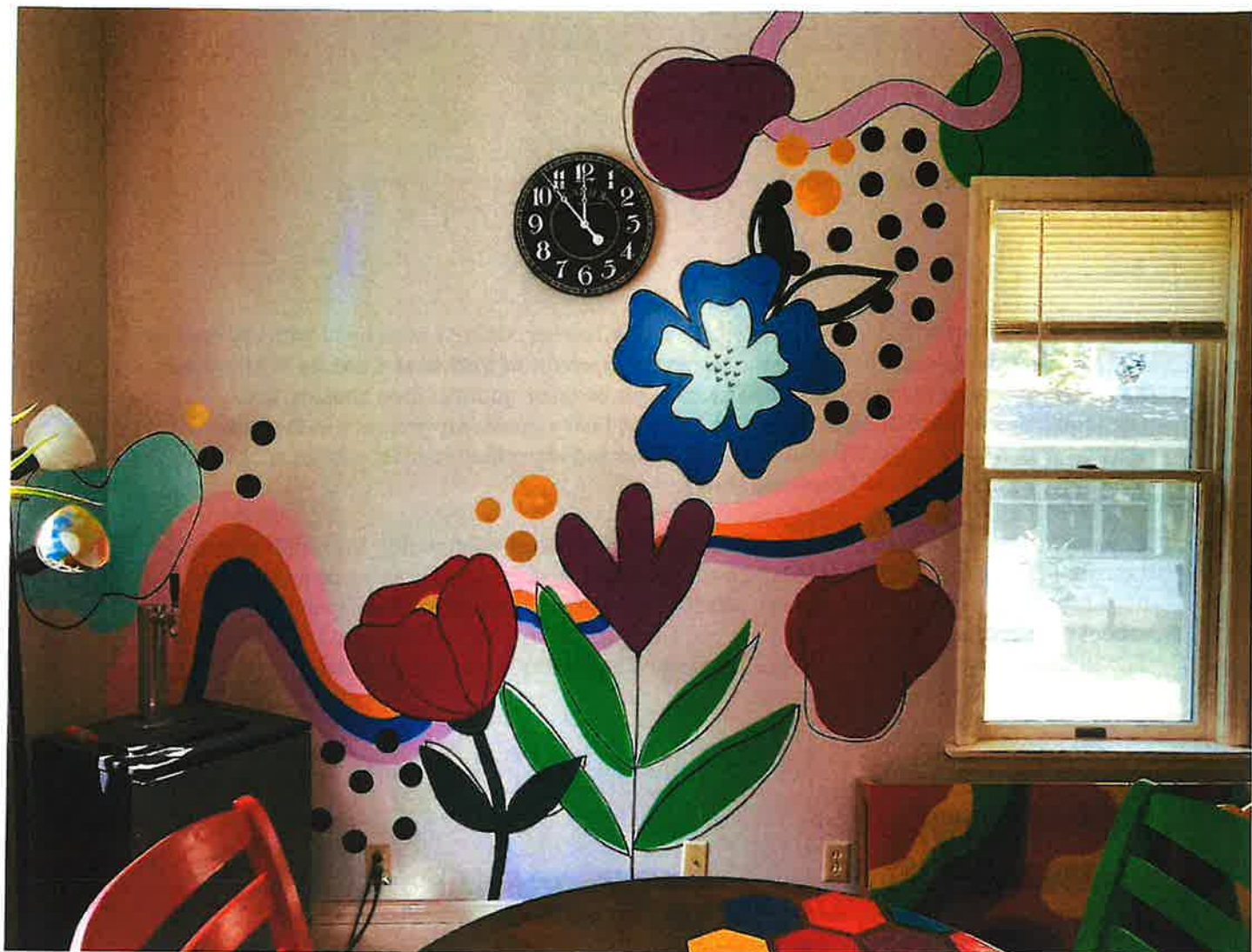
Dining Room Wall Mural 64 sq ft

Painted with interior and acrylic paint. Designed and executed by me over a span of 3 days.