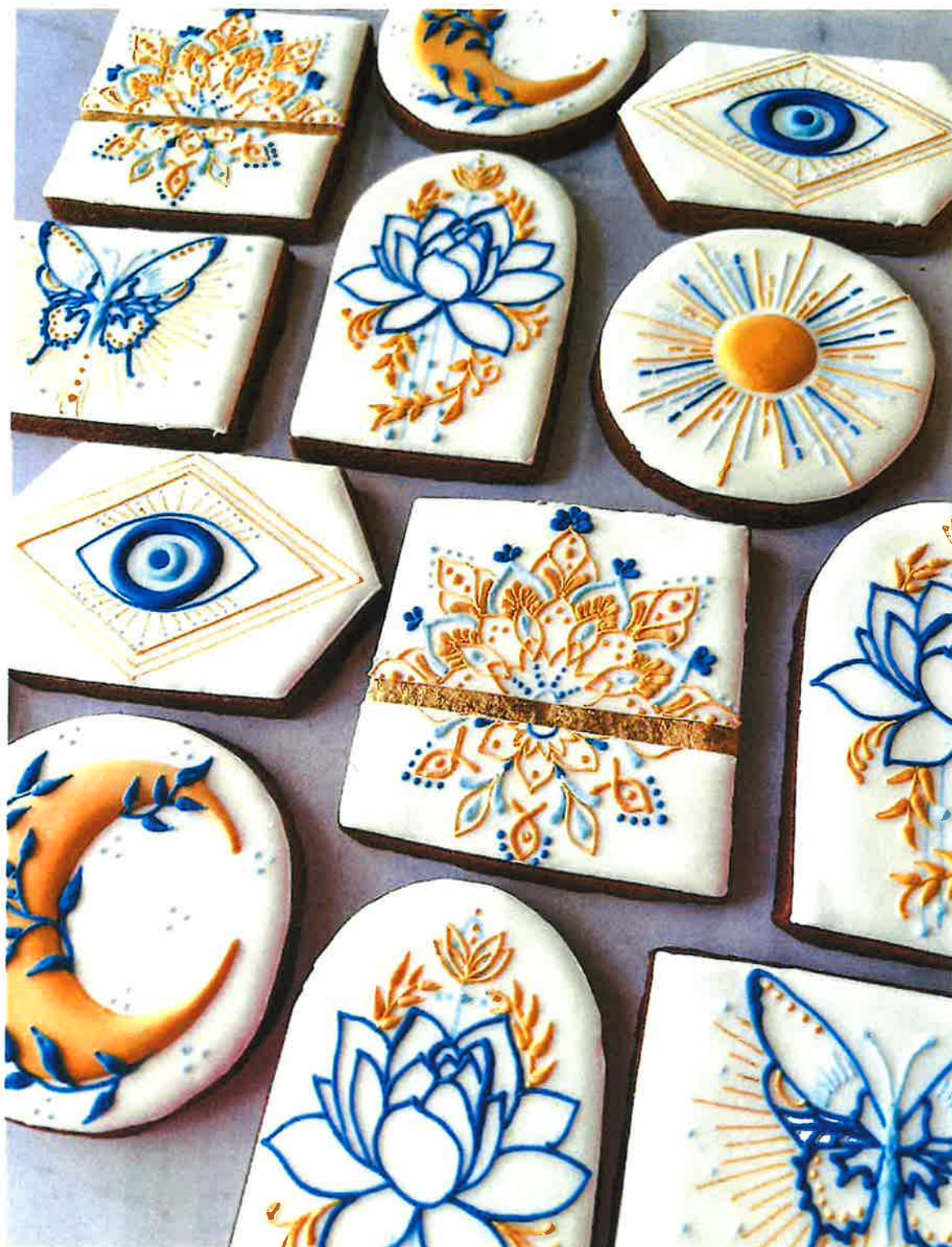
Mandala/Mystic Custom Cookie Set 4" sugar cookies

Chocolate Sugar cookies decorated with royal icing.