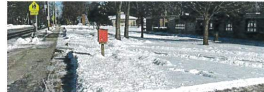
Mailbox to be removed by others