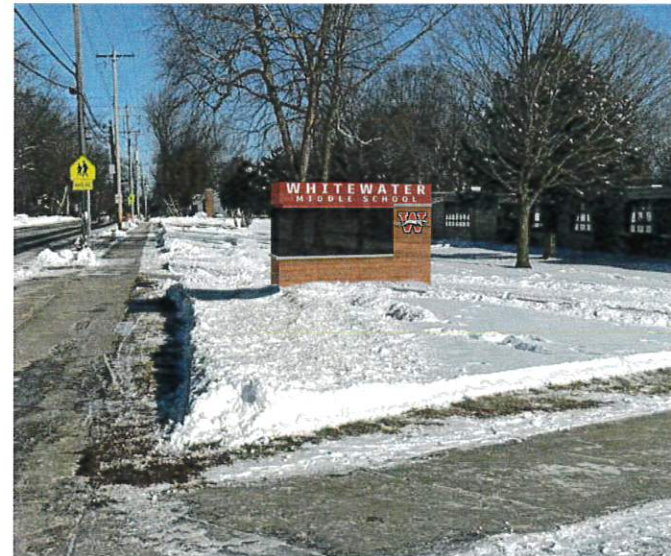
Install sign close to same location as mailbox was, 16' from road edge