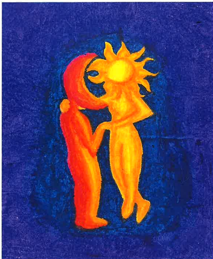
16x20 oil pastel 'sun and moon lovers'