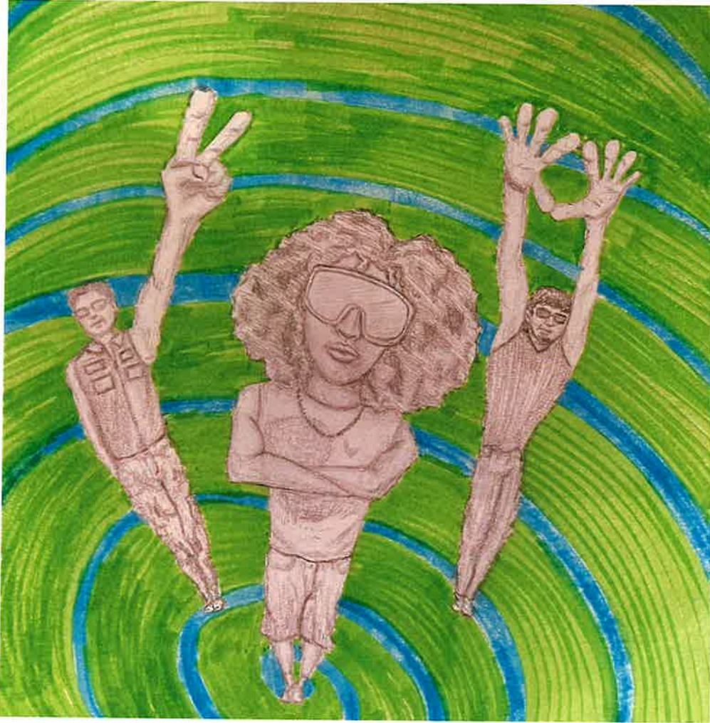
9x9, pencil & highlighter birthday present