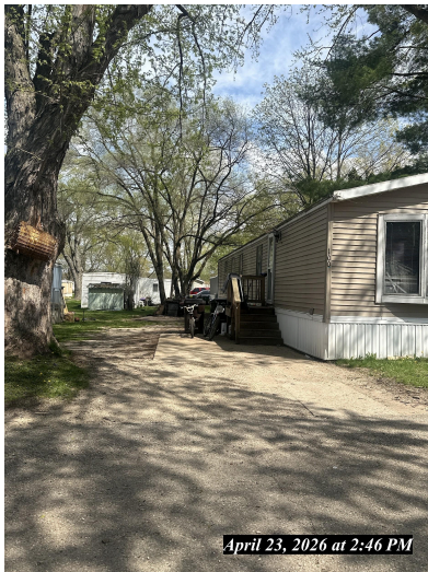
April 23, 2026 at 2:46 PM