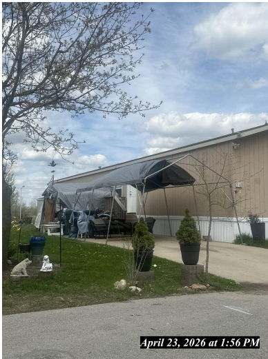
April 23, 2026 at 1:56 PM