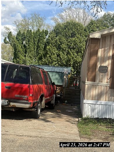
April 23, 2026 at 2:47 PM