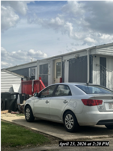
April 23, 2026 at 2:20 PM