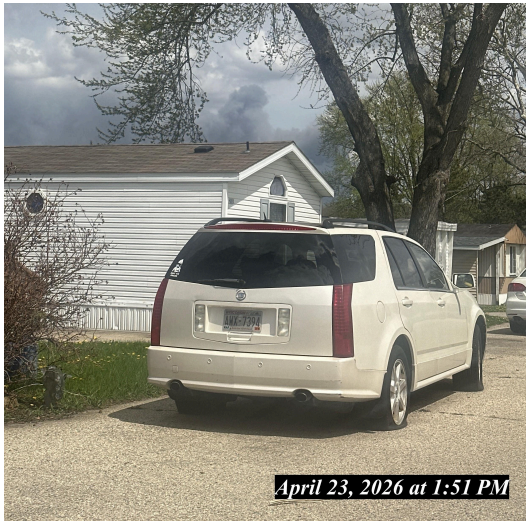
April 23, 2026 at 1:51 PM