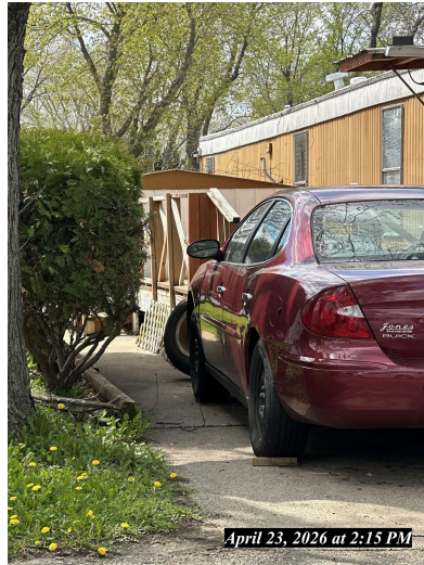
April 23, 2026 at 2:15 PM