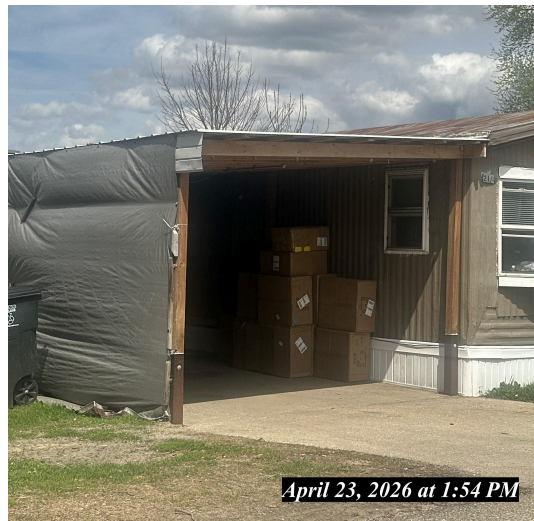
April 23, 2026 at 1:54 PM