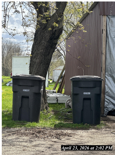
April 23, 2026 at 2:02 PM