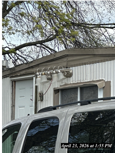
April 23, 2026 at 1:55 PM