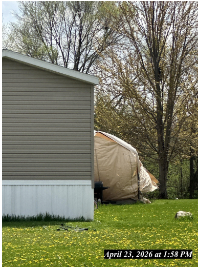
April 23, 2026 at 1:58 PM