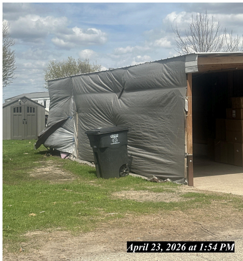
April 23, 2026 at 1:54 PM