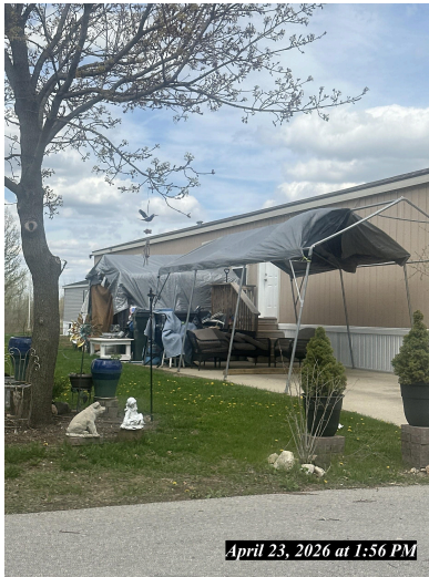
April 23, 2026 at 1:56 PM