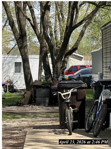
April 23, 2026 at 2:46 PM