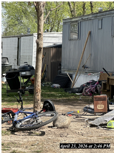
April 23, 2026 at 2:46 PM