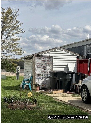
April 23, 2026 at 2:20 PM