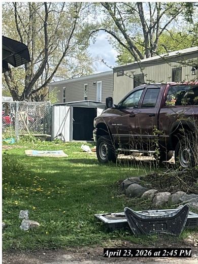
April 23, 2026 at 2:45 PM