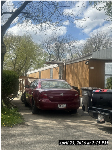
April 23, 2026 at 2:15 PM