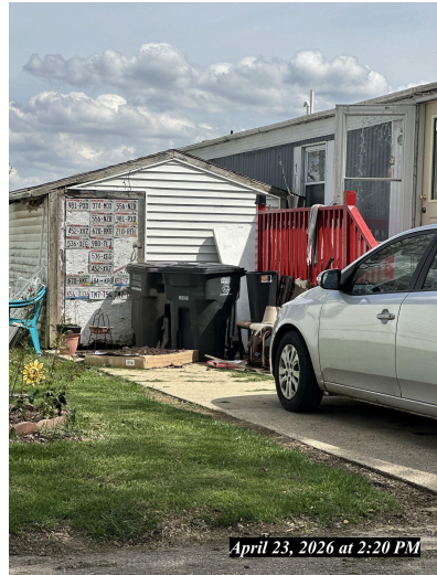
April 23, 2026 at 2:20 PM