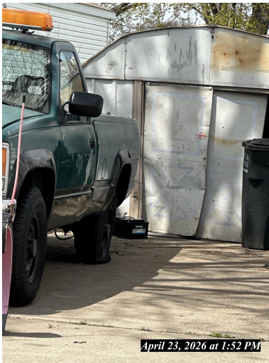
April 23, 2026 at 1:52 PM