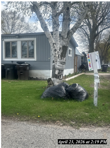
April 23, 2026 at 2:19 PM