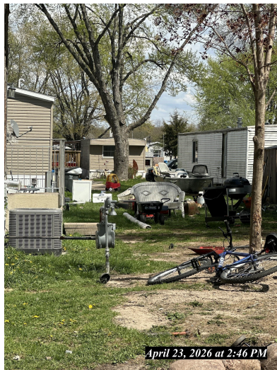
April 23, 2026 at 2:46 PM