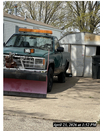
April 23, 2026 at 1:52 PM