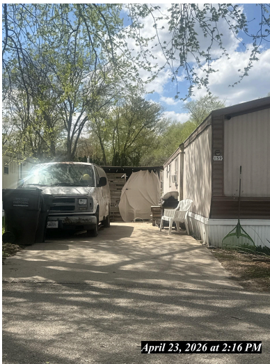
April 23, 2026 at 2:16 PM