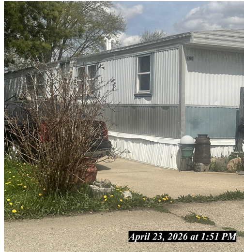
April 23, 2026 at 1:51 PM