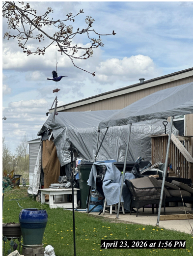
April 23, 2026 at 1:56 PM