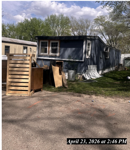
April 23, 2026 at 2:46 PM