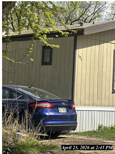
April 23, 2026 at 2:45 PM