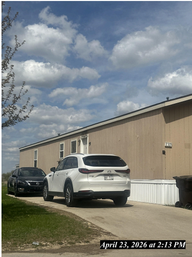
April 23, 2026 at 2:13 PM