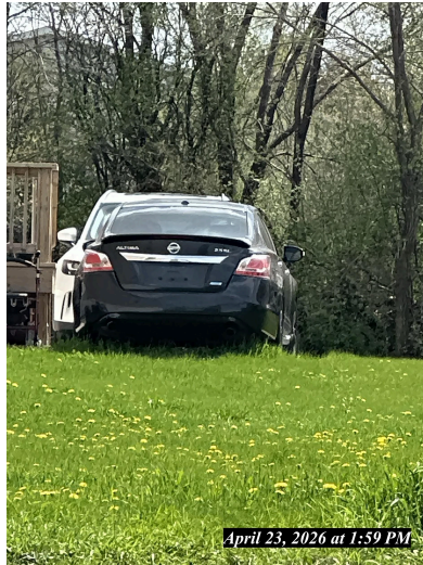
April 23, 2026 at 1:59 PM