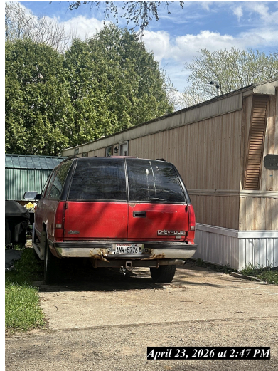
April 23, 2026 at 2:47 PM