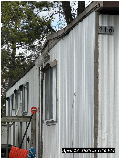
April 23, 2026 at 1:56 PM