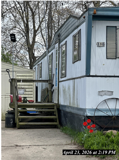
April 23, 2026 at 2:19 PM