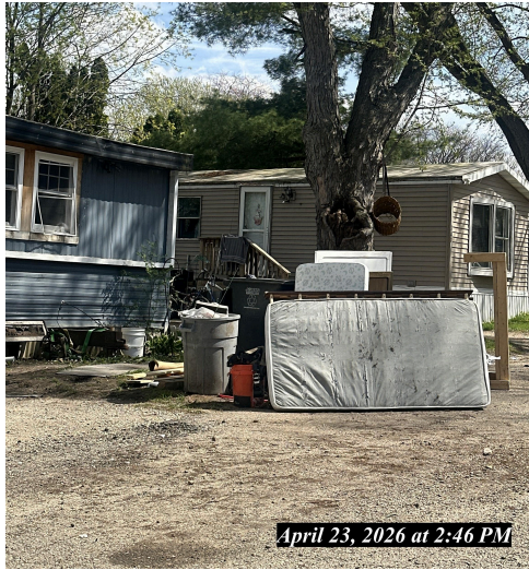
April 23, 2026 at 2:46 PM