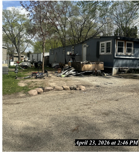
April 23, 2026 at 2:46 PM