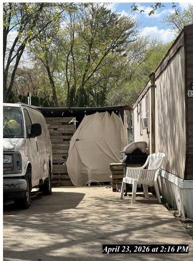
April 23, 2026 at 2:16 PM