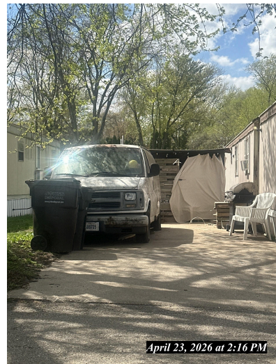
April 23, 2026 at 2:16 PM