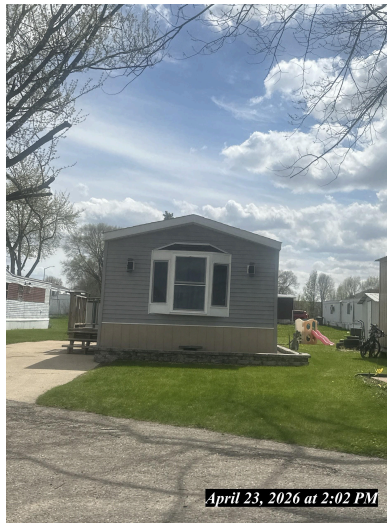
April 23, 2026 at 2:02 PM