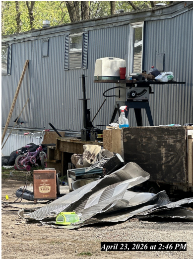
April 23, 2026 at 2:46 PM