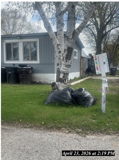
April 23, 2026 at 2:19 PM