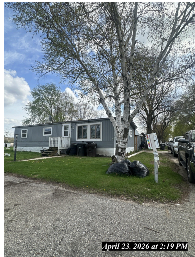
April 23, 2026 at 2:19 PM