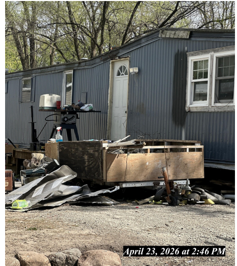
April 23, 2026 at 2:46 PM