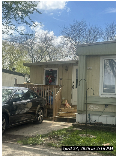
April 23, 2026 at 2:16 PM