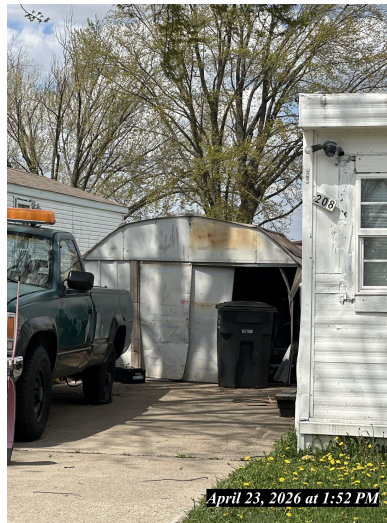
April 23, 2026 at 1:52 PM