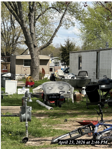
April 23, 2026 at 2:46 PM