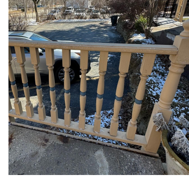
Example of turned spindles