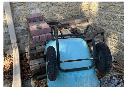
5. Remove bricks