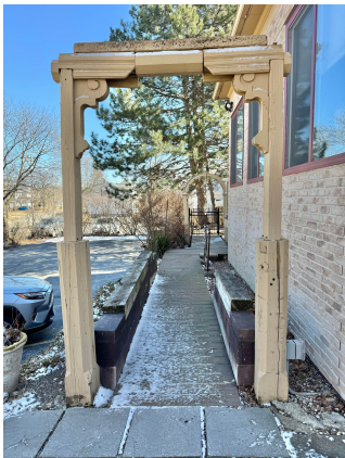
3. Remove RR ties, cinder blocks 4. Remove Square arch Composite path to match