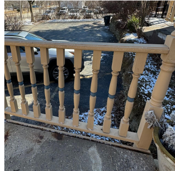
Example of turned spindles