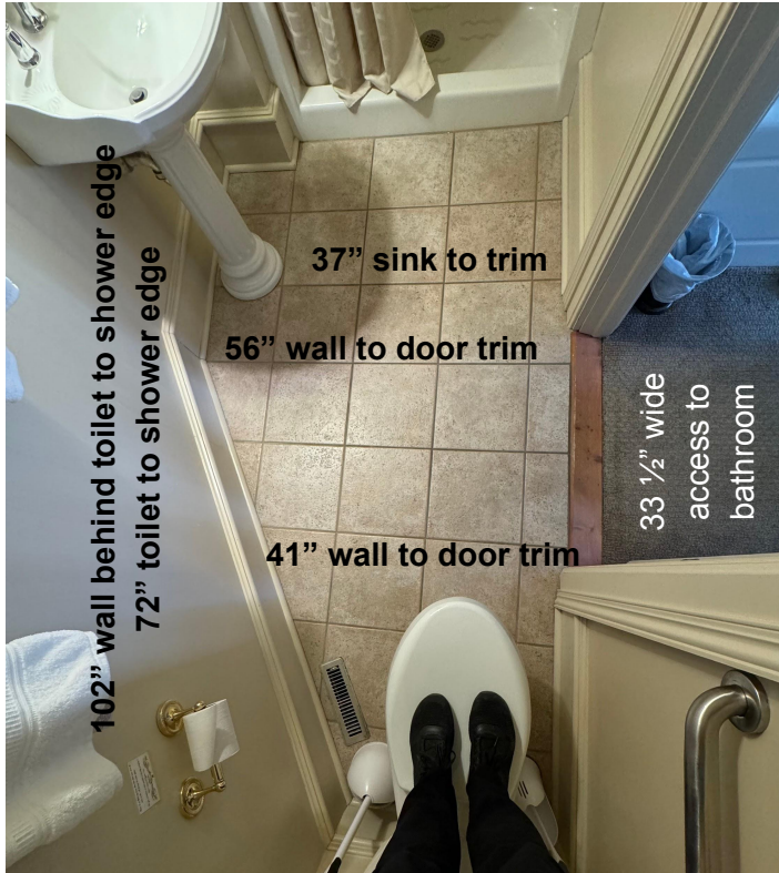
28 1/2" across (wall behind toilet)

According to ADA standards, a wheelchair accessible bathroom stall should be a minimum of 60 inches wide and 56 inches deep if the toilet is wall-mounted, providing enough space for a wheelchair user to maneuver comfortably; this includes necessary clearance space around fixtures like the toilet and sink. 🔗