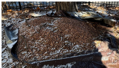
5. Remove pile of rocks