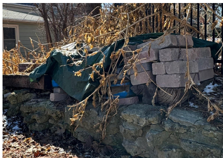
5. Remove pallet of paver stones