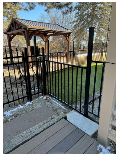
6. Remove RR ties by fence 7. Connect Composite path to gazebo