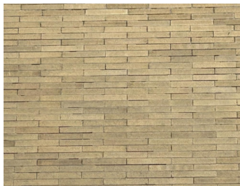
EXISTING PHOTO OF BRICK