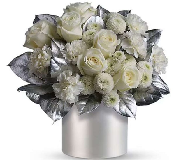
Custom display for check-in table