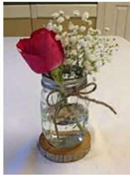
Flowers and garnish to be placed in table centerpiece jars