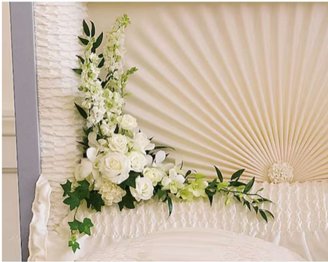
Custom corner arrangement for photobooth