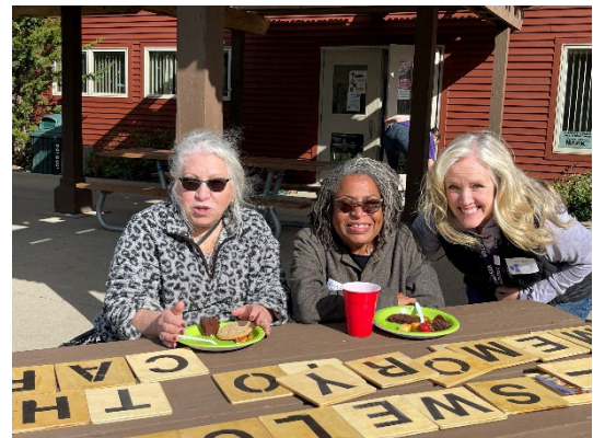
Participants enjoy Family Day at Retzer Nature Center

Professional Development: I attended a webinar hosted by the Wisconsin ADA Coordinators called "Digital Access Basics," attended two sessions hosted by the Wild Wisconsin Winter Web Conference titled "Get to 'Why': Stop Taking Orders and Become a Marketing Guide" & "Effective Email Etiquette," and a UW-Milwaukee hosted webinar titled "Understanding Where Your Time Goes: Lessons Learned from Project Management and Agile."