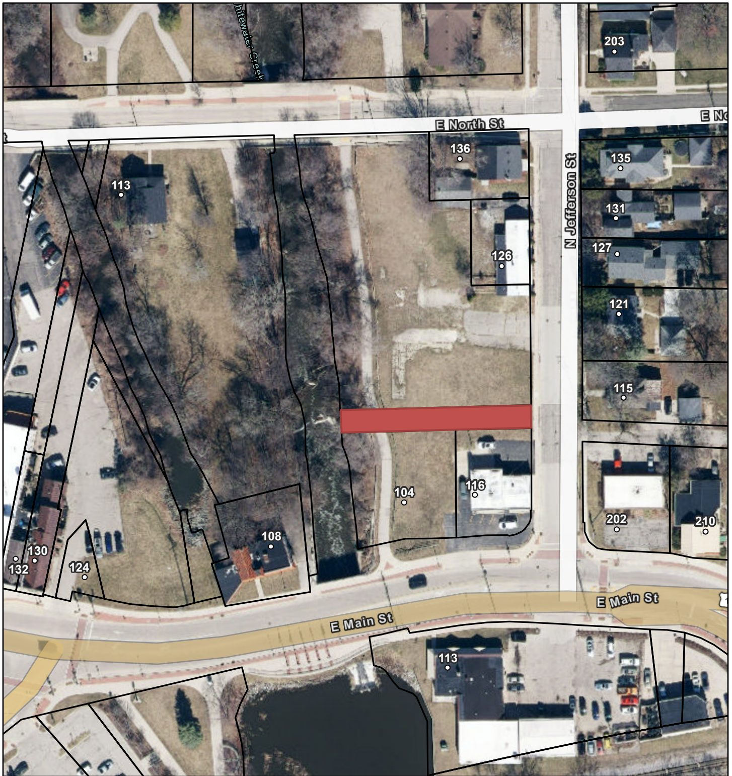
EXHIBIT A - Alley to be Discontinued