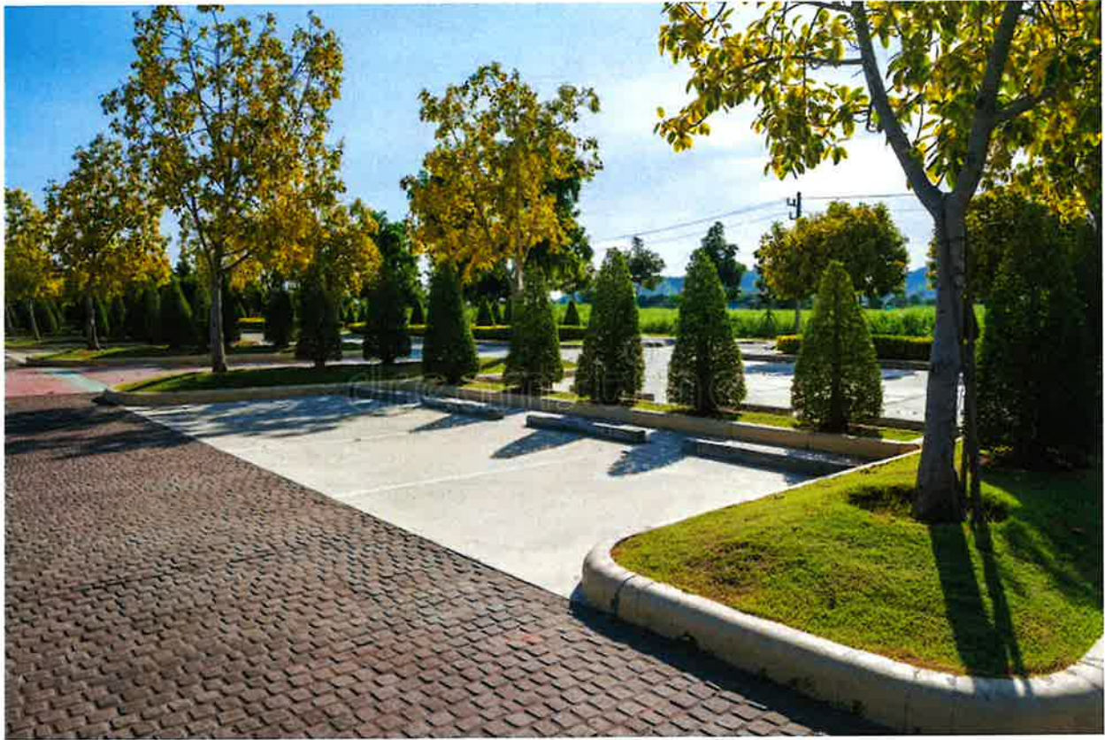
Figure 1: Parking Lot Landscaping Example