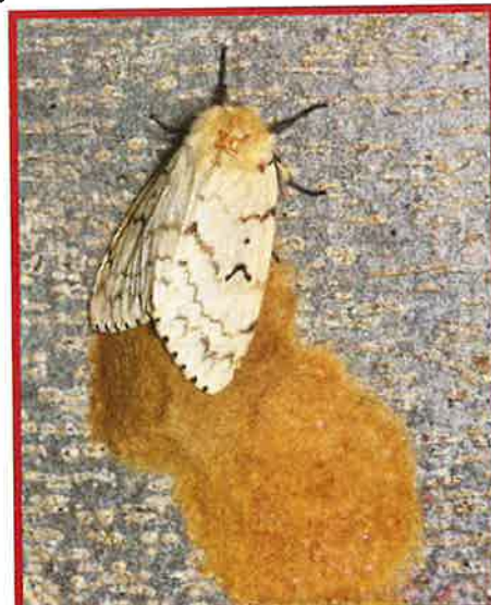
Adult female spongy moth with egg mass.