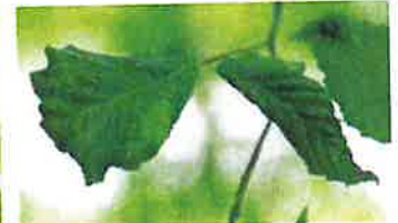
Figure 2.—Banding appearance and shrunk leaves associated with BLD.