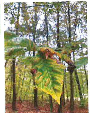
Figure 3.—Advanced symptoms of BLD with chlorotic striping.