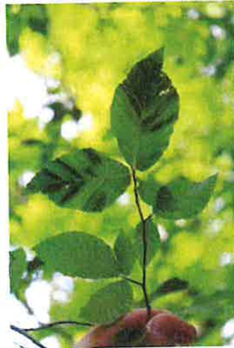
Figure 1.—Banding appearance associated with BLD.

BLD appears to be spreading, particularly from west to east based on the number of new county detections in recent years. Insect or avian vectors as well as human-mediated movement of the nematode are possible modes of its dispersal that are currently being studied. There is likely a delay between initial nematode infestation and BLD detection as L. crenatae has occasionally been confirmed in asymptomatic tissue at the molecular level.