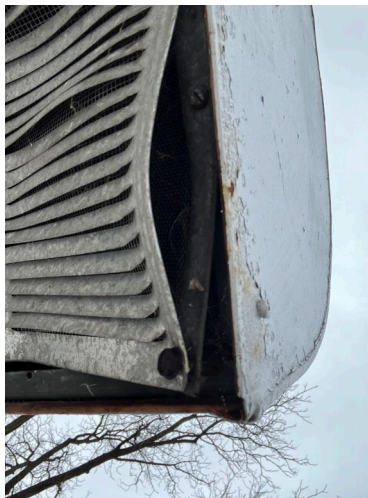
Figure 1: inadequate screening for reservoir vent