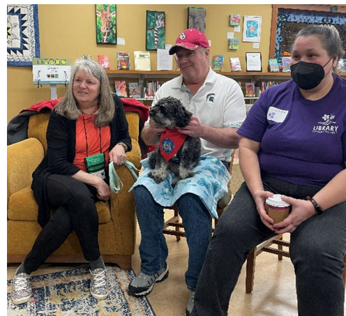
Spring Family Day included a visit from therapy dogs, including Rylee as pictured on an attendee's lap

April 6 th was a fun day for families at the Spring Family Day offered by the Library Memory Project at Dwight Foster Public Library in Fort Atkinson. We had 22 people enjoying art, live music, therapy dogs, bingo with prizes, and more. It was a fantastic way to connect with our community!