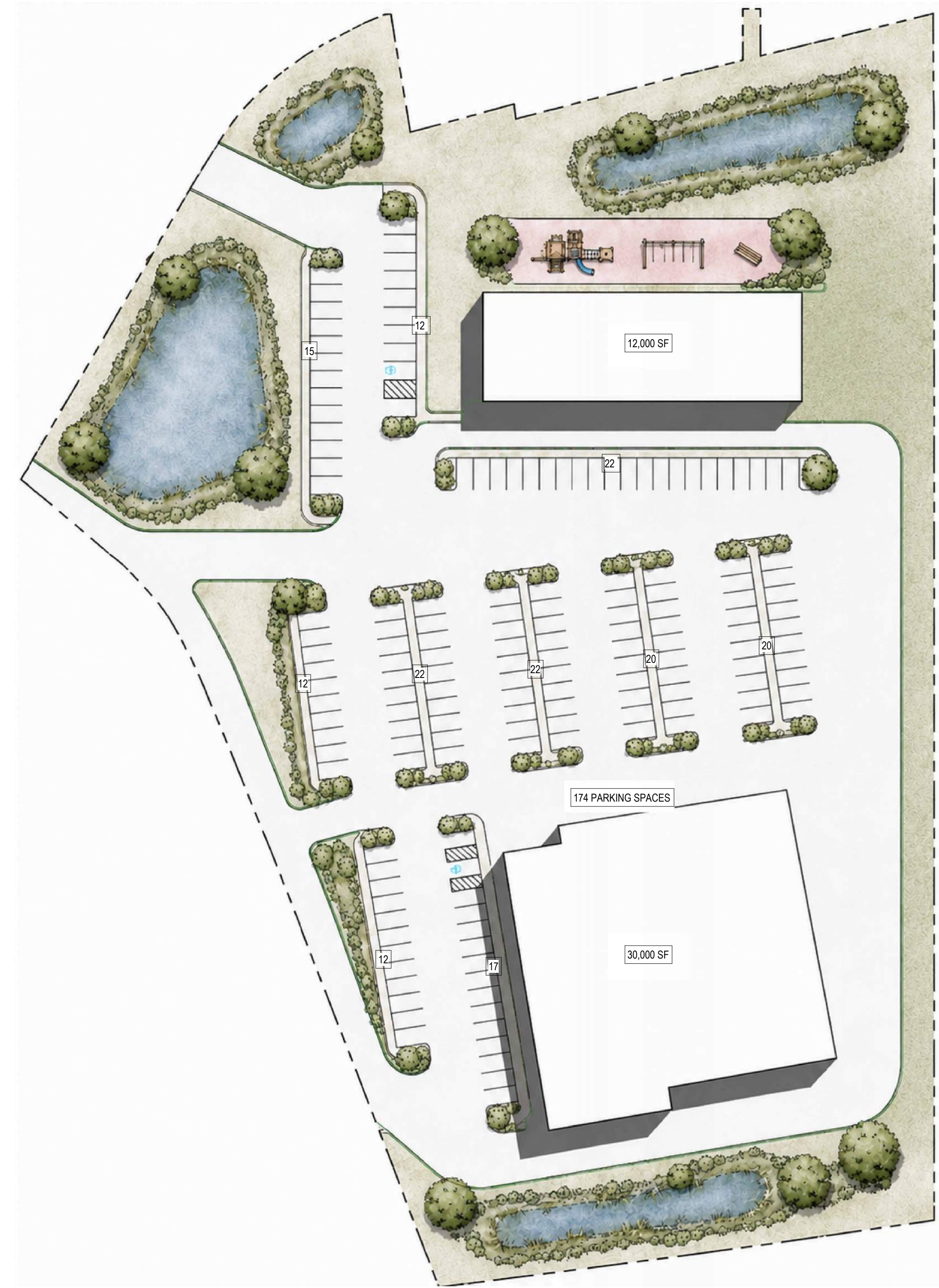
3 SITE PLAN OPTION 2 SCALE: 1" = 50'-0"