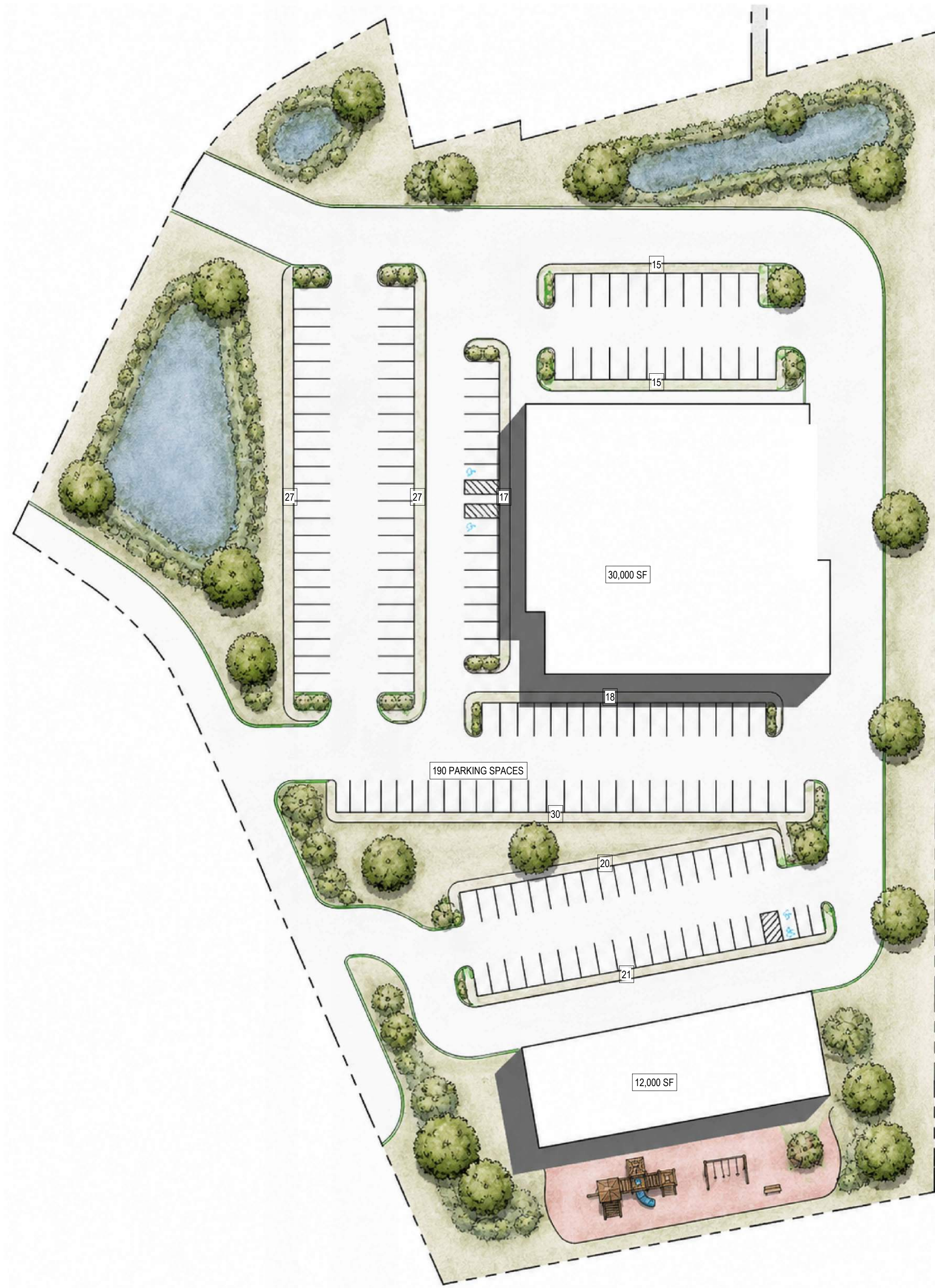
2 SITE PLAN OPTION 1 SCALE: 1" = 50'-0"