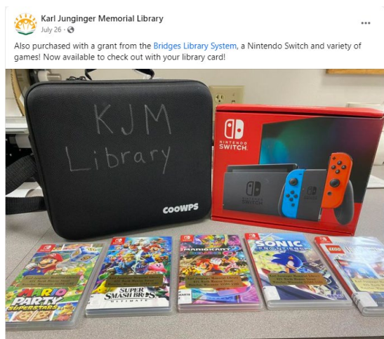
Karl Juninger Memorial Library

Each library was also able to apply for a non-competitive grant, and award amounts were based on size. Small libraries received $2,000, medium libraries received $2,500 and large libraries received $3,000. Projects funded were to be in either accessibility, marketing or technology categories. Some of the items purchased included RFID pads, iPads for board member's electronic packets, window display units, Library of Things items, step and wash for youth to use in bathrooms, Yoto players, early literacy kits, water fountains with bottle fillers, people counters, teen space upgrades, STEM kits, changing station, outdoor seating and dye sublimation printer, inks and supplies.