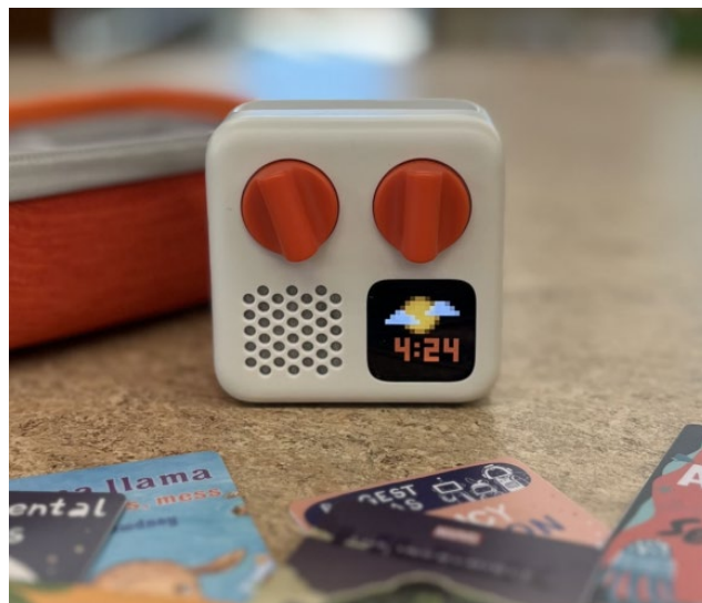
Yoto Players at Dwight Foster and Oconomowoc