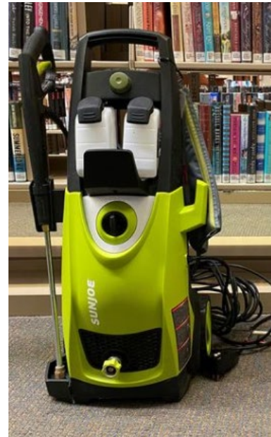
Pewaukee Pressure Washer

Each library was also able to apply for a non-competitive grant, and award amounts were based on size. Small libraries received $2,000, medium libraries received $2,500 and large libraries received $3,000. Projects funded were to be in either accessibility, marketing or technology categories. Some of the items purchased included RFID pads, iPads for board member's electronic packets, window display units, Library of Things items, step and wash for youth to use in bathrooms, Yoto players, early literacy kits, water fountains with bottle fillers, people counters, teen space upgrades, STEM kits, changing station, outdoor seating and dye sublimation printer, inks and supplies.