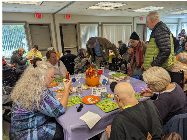
Families gather around to play bingo at Family Day

I have been invited to serve on the Expanding Memory Cafes Enhancing Meaningful Connections (EMC 2 ) Alliance over the next 12 months. The Alliance has been formed to create a national plan to grow memory cafes from 900 to 9000 across the United States. Monthly virtual meetings are being held with alliance members and advisors on specific topics related to creating a plan. I am particularly interested in the training model to get memory café facilitators trained.