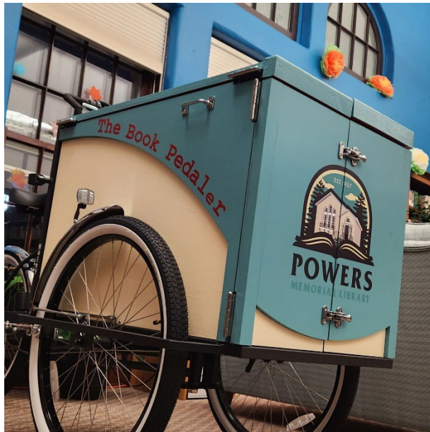
Palmyra Book Bike

facing book bins for their children's books to display books better to appeal to the little ones. The small library category was shared between the Big Bend and Palmyra libraries - Big Bend purchased STEM kits and Palmyra purchased a book bike.