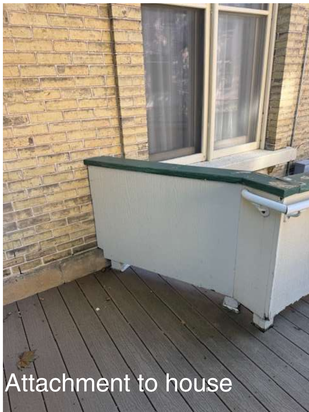
Attachment to house