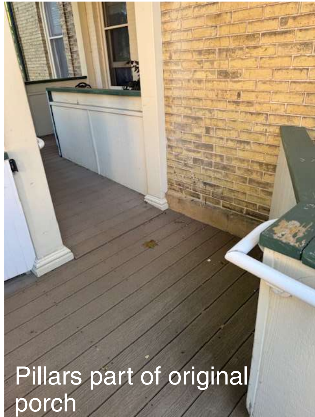
Pillars part of original porch