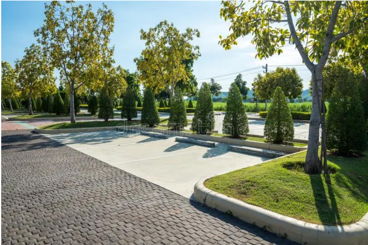
Figure 1: Parking Lot Landscaping Example