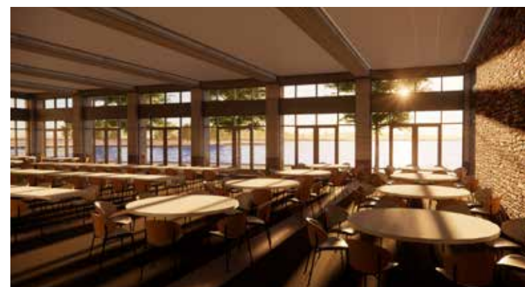
view across Banquet Hall