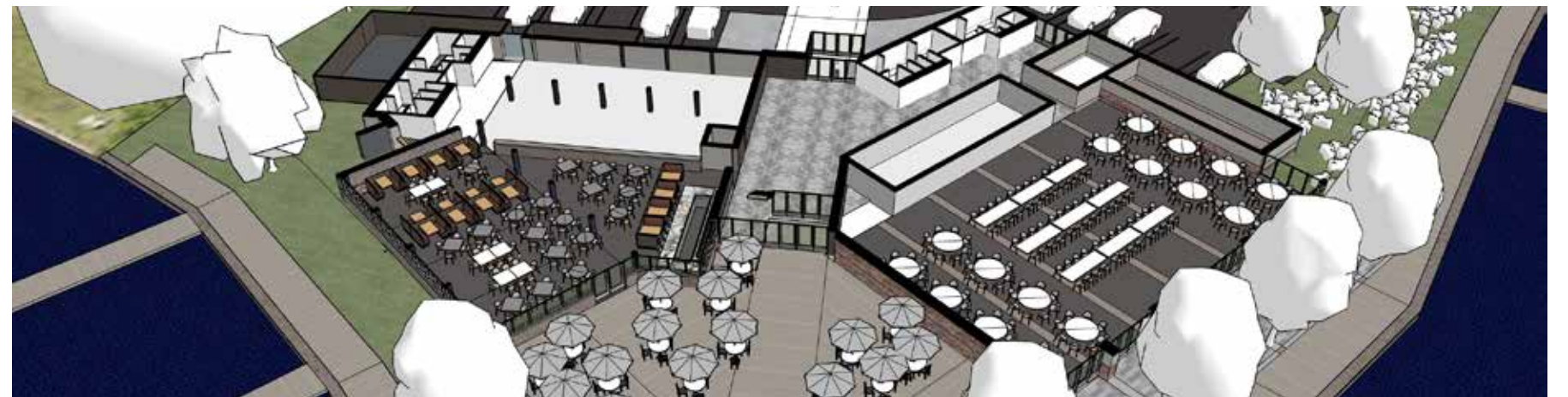
Lake Level Birdseye View page 8