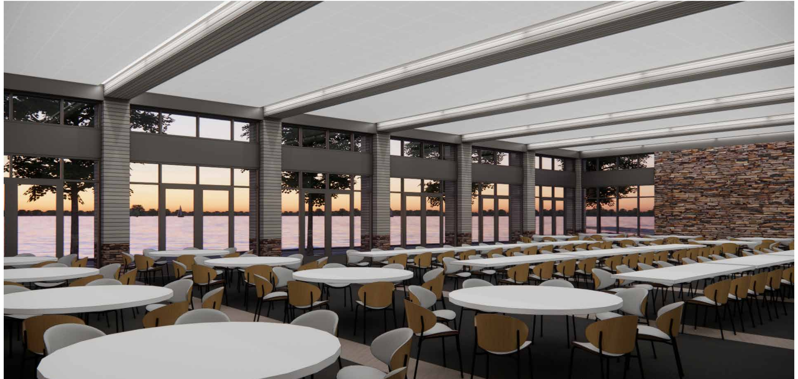
Banquet Hall view of Pontiac Lake