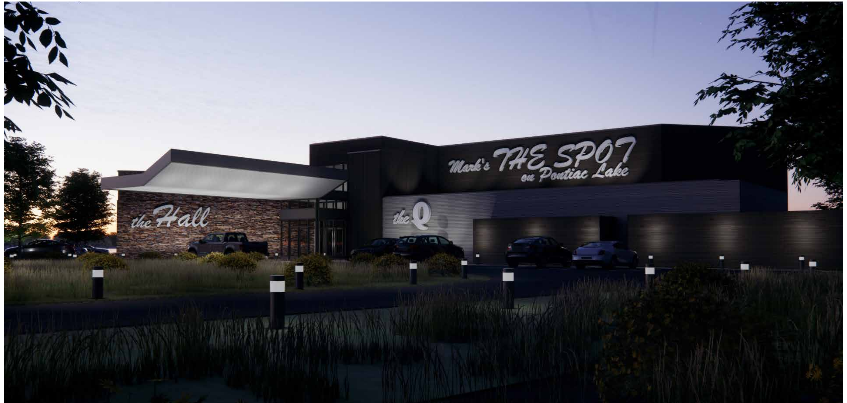
Mark's THE SPOT on Pontiac Lake