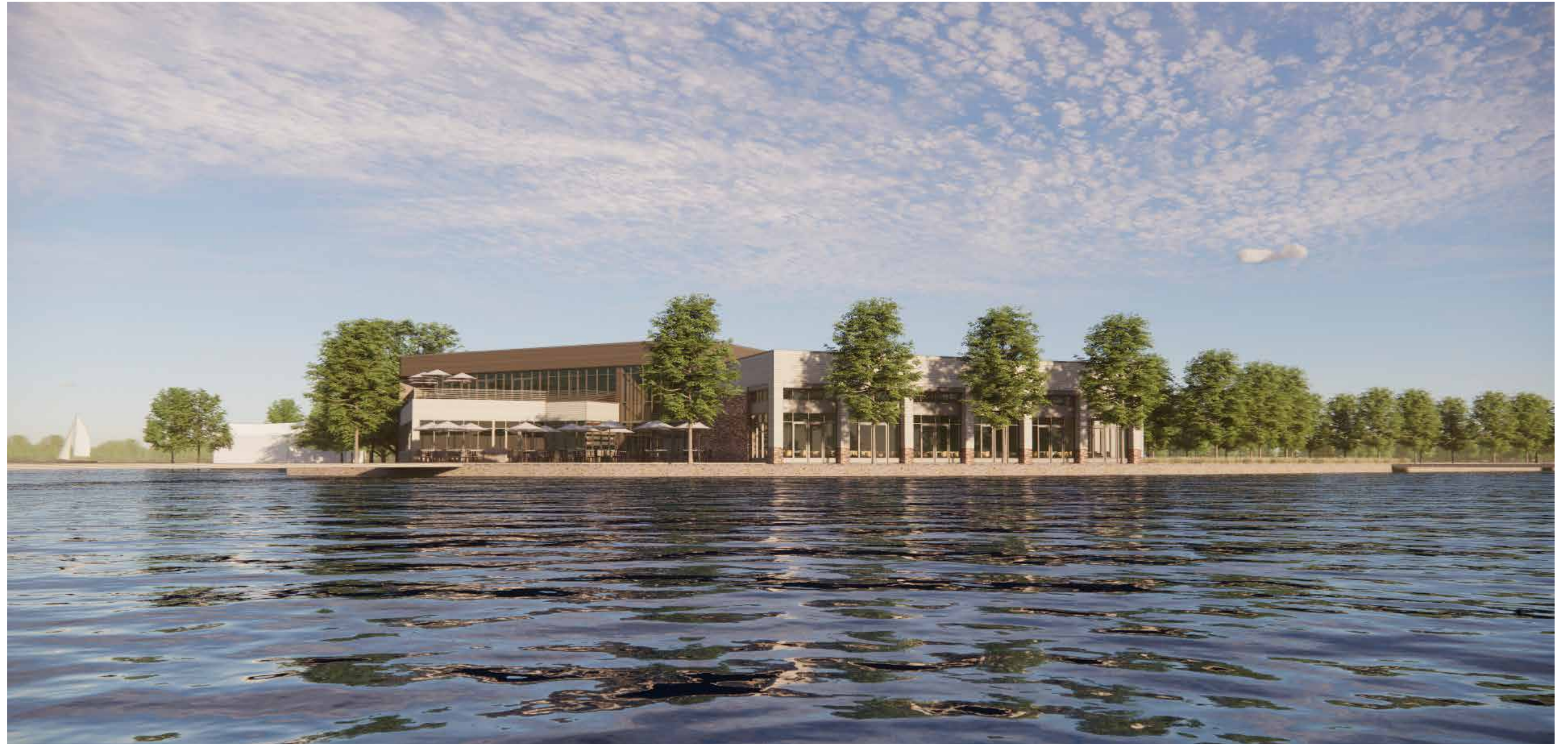
Mark's THE SPOT on Pontiac Lake