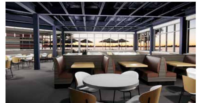
view across Restaurant page 11