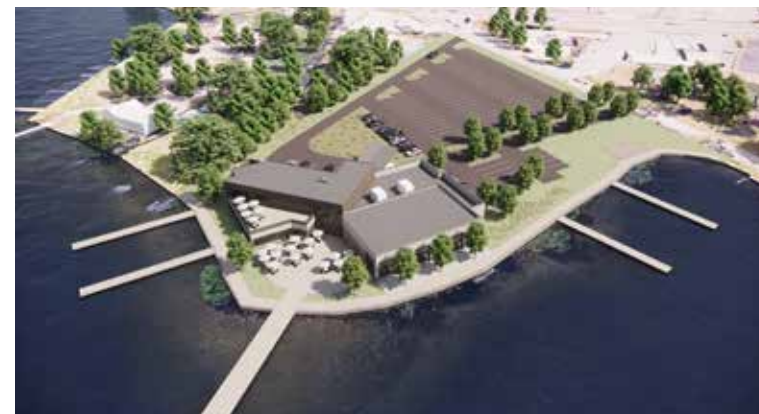
Birdseye view from North West