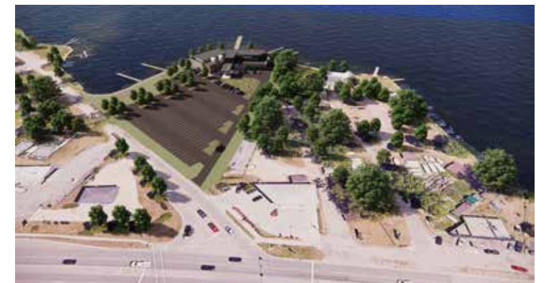
Birdseye view from South East page 5