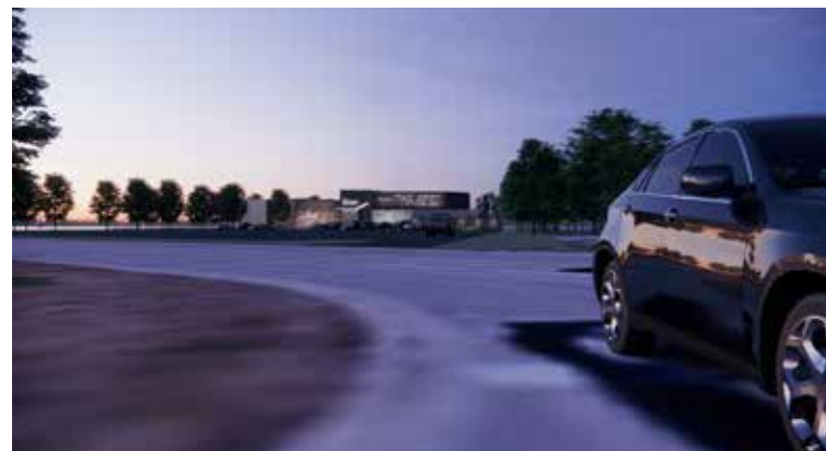
Main Intersection view of the Spot