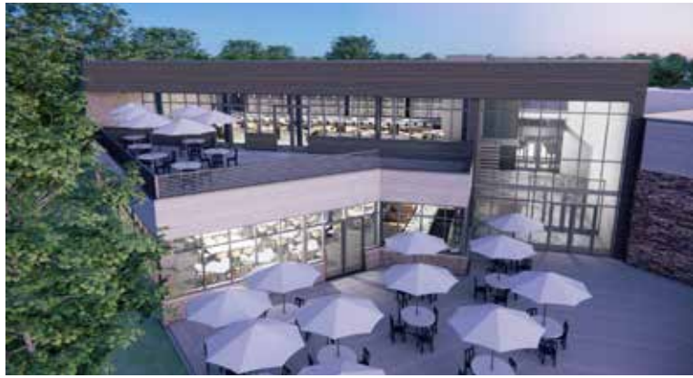
view of Bar page 12