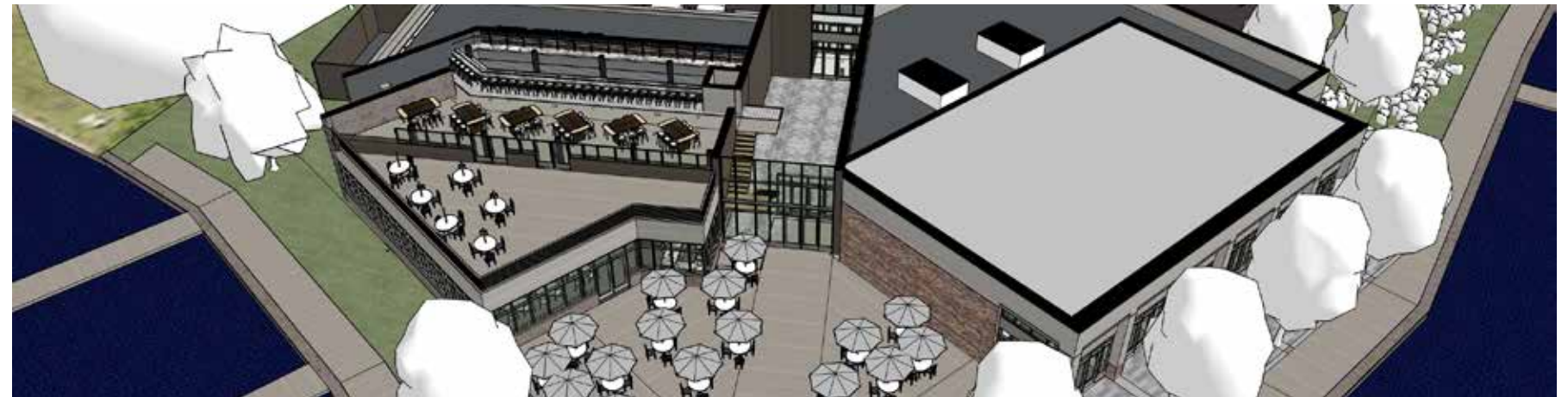
Bar Level Birdseye View page 9