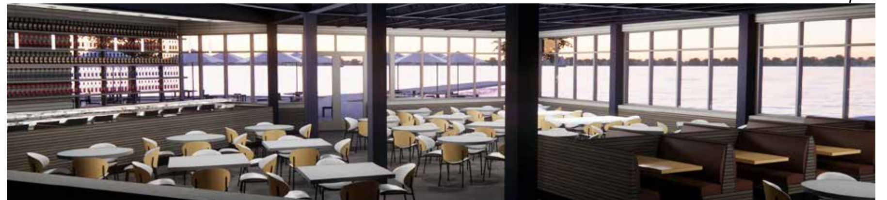
view of Pontiac Lake page 4