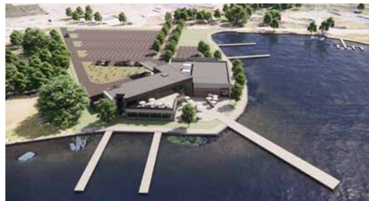
Birdseye view from North East