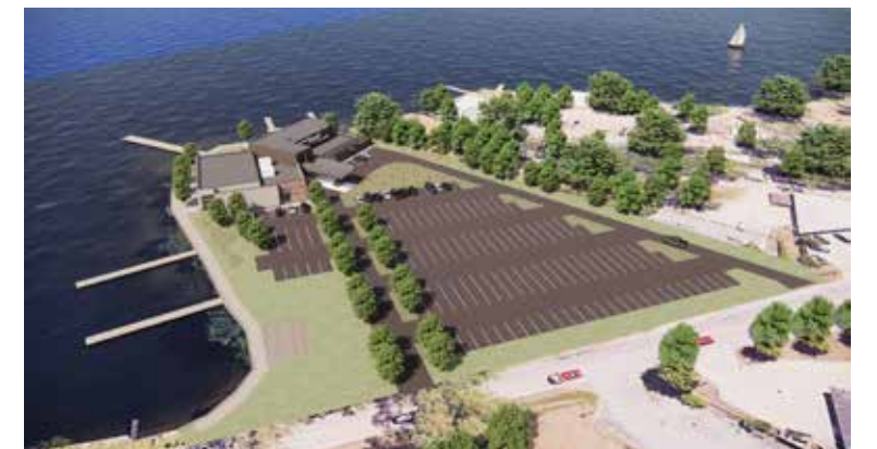
Birdseye view from South West page 6