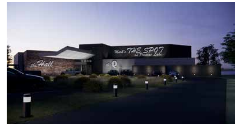
Entry Drive view of the Spot page 7