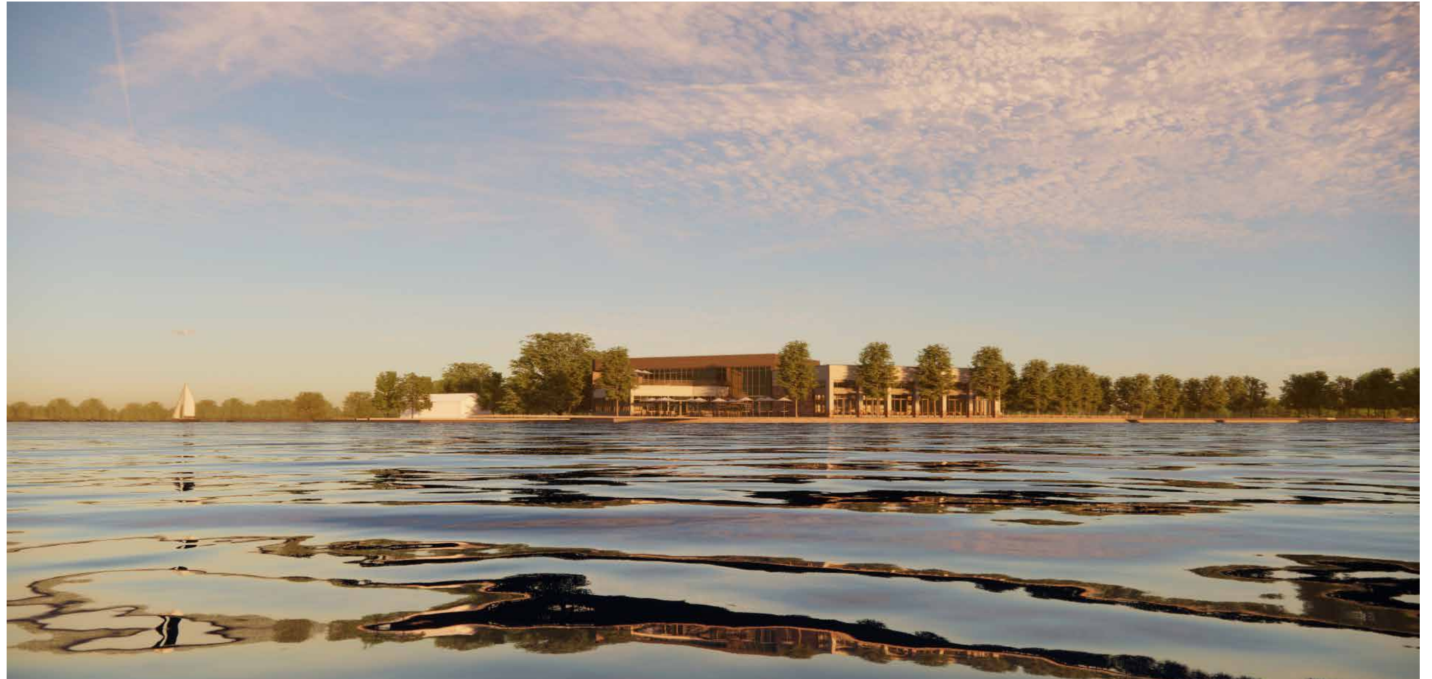
Mark's THE SPOT on Pontiac Lake