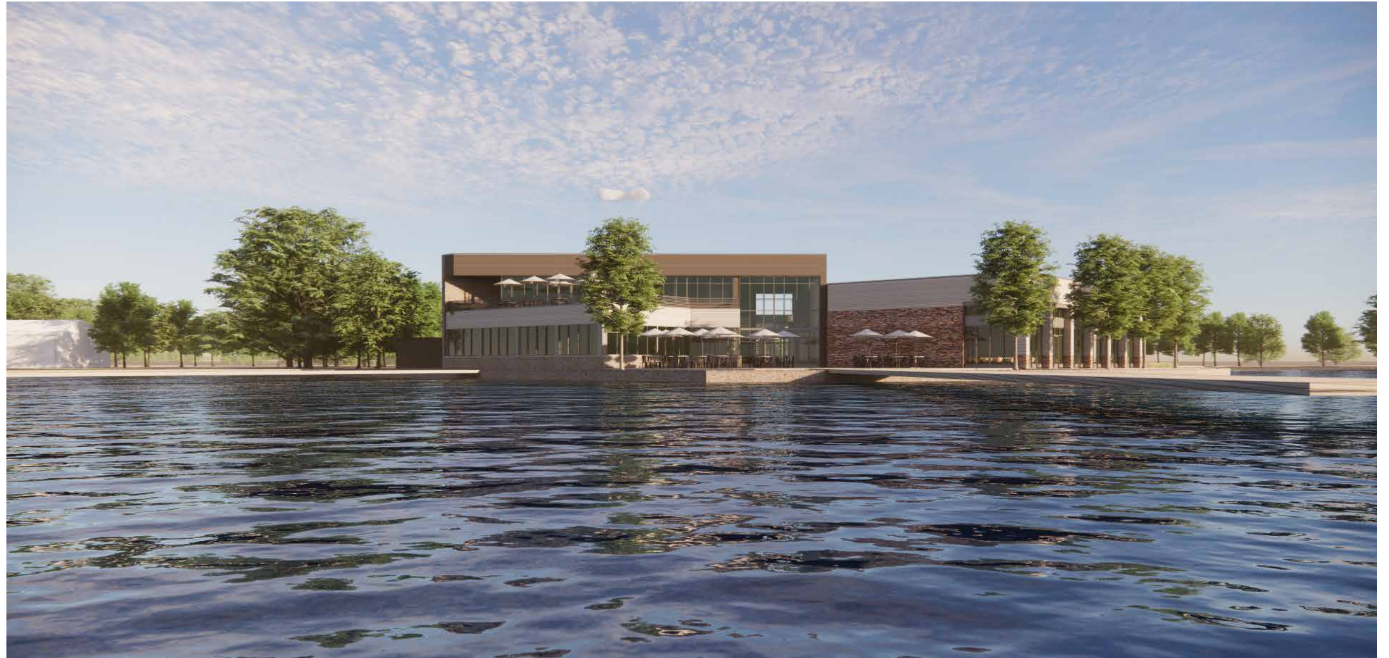
Mark's THE SPOT on Pontiac Lake