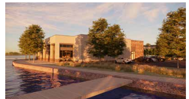
view of Banquet Hall page 10