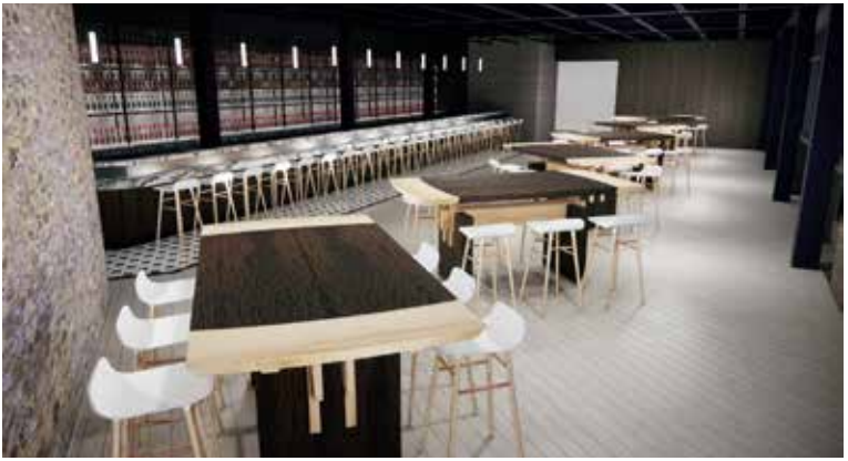
view across Bar

Bruce Roberts Originals llc 21 November 2024