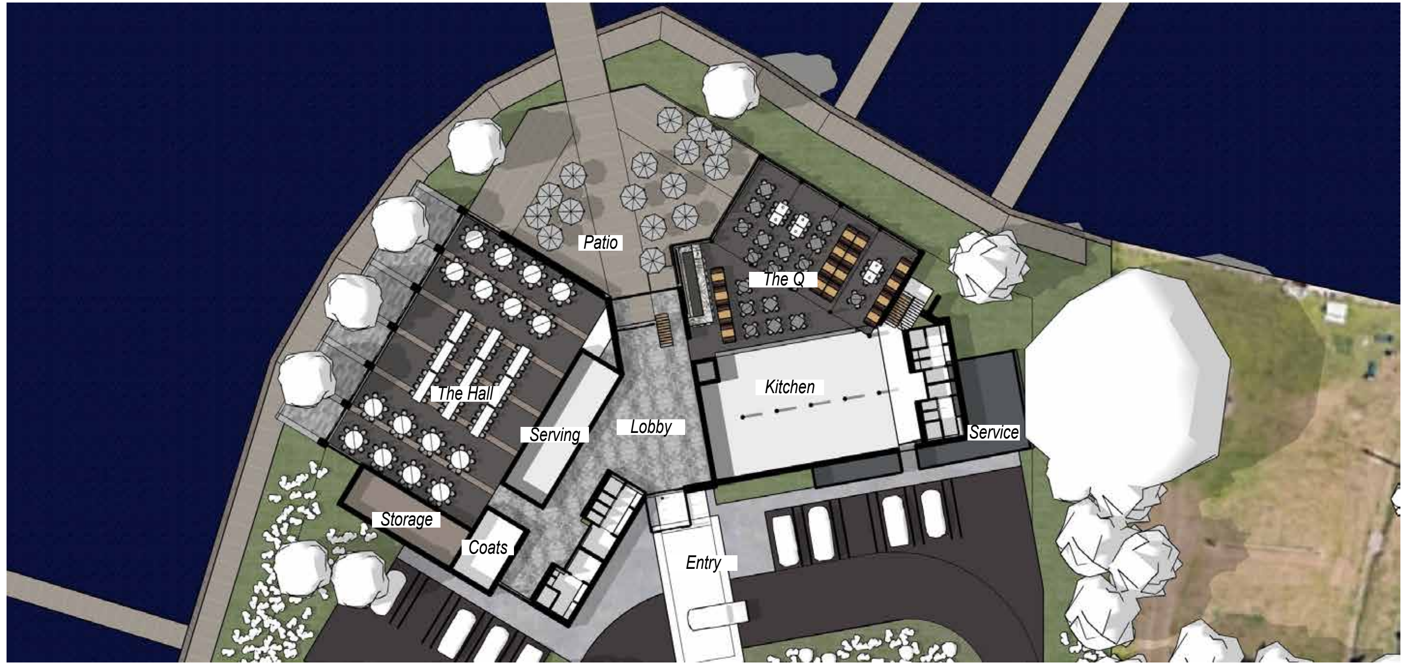
Lake Level Floor Plan