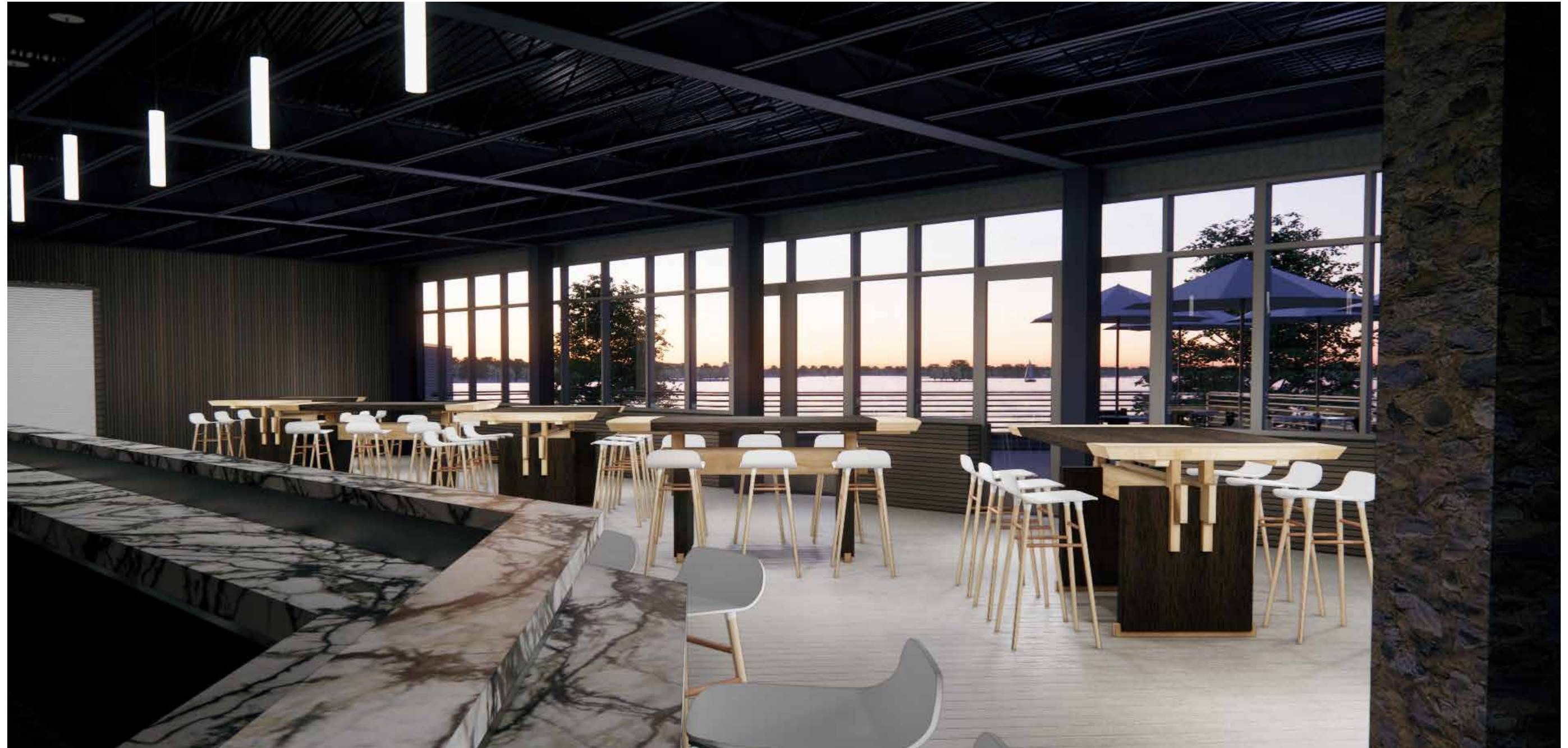
Bar view of Pontiac Lake