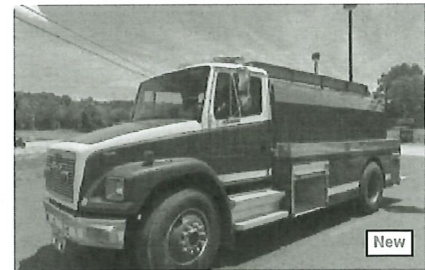
1996 Freightliner FL80 2000 Gallon Tanker w/ Pump (T1428)