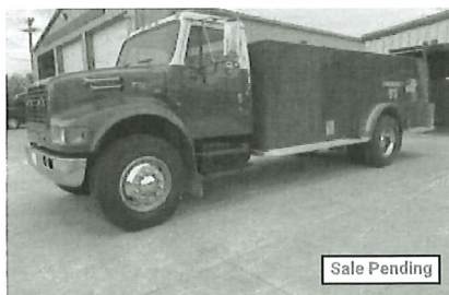
1998 International 4900 Tanker 250/1500 (T1346)