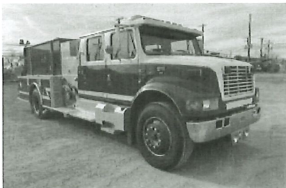
1998 KME International Pumper Tanker 1250/1250 (T1403)