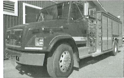
1998 Freightliner Tanker Pumper 1000/1500/30 (T1366)