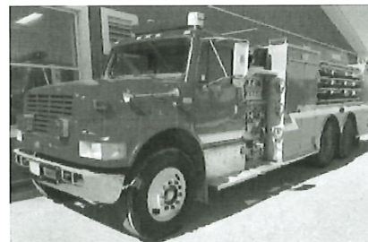
1998 International Tandem Pumper Tanker 500/3000 (T1333)