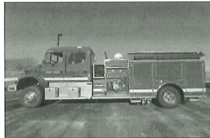
1998 Freightliner FL80 4X4 Pumper Tanker 1750/1250 (E4796)