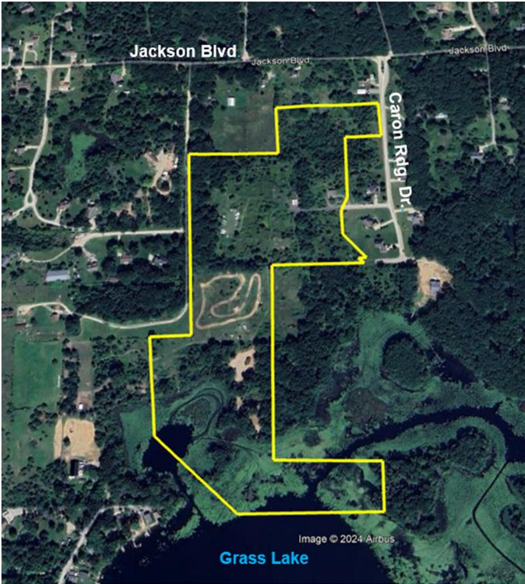
Aerial Photograph of Site