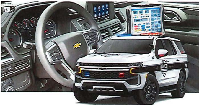
2024 Chevrolet Tahoe PPV shown. Vehicle shown with upfits from an independent supplier and are not covered by the GM New Vehicle Limited Warranty. GM is not responsible for the safety and quality of independent supplier alterations.