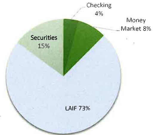
June 30, 2025