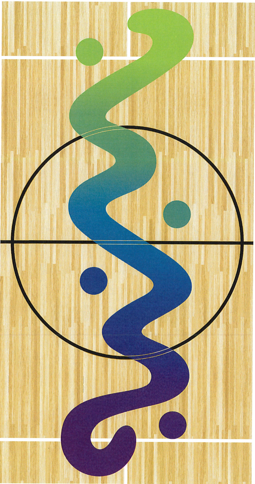
CENTER COURT (X8): 288" X 80.5" - VINYL