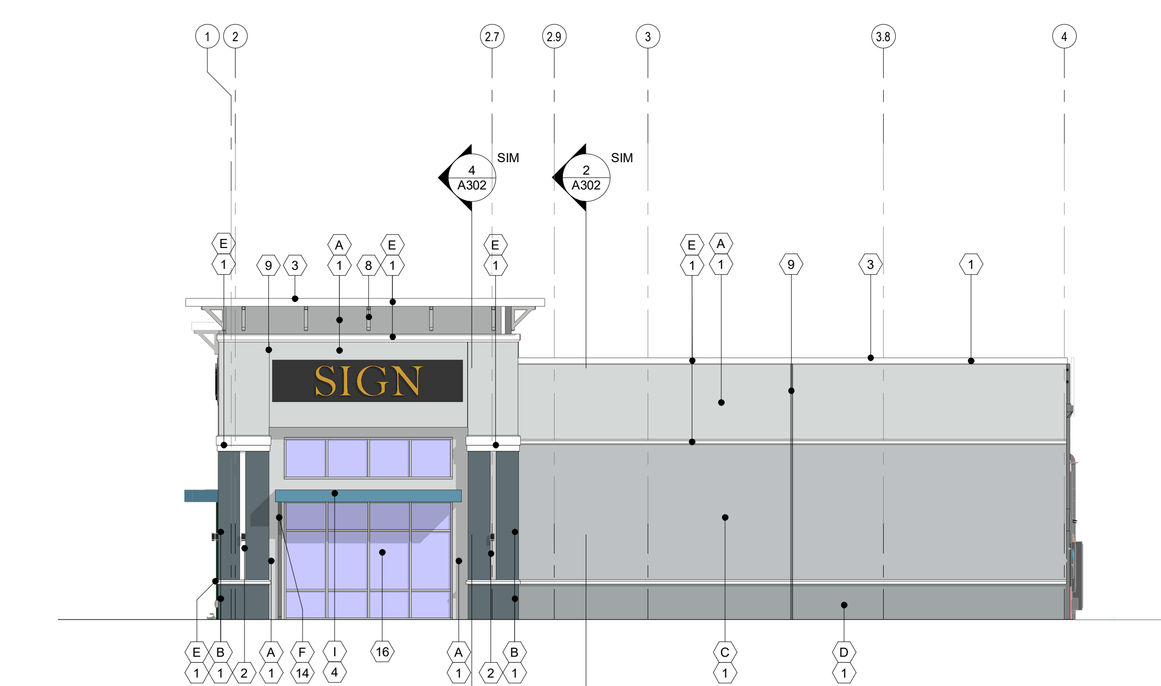
1 North Elevation SCALE: 1/8" = 1'-0"