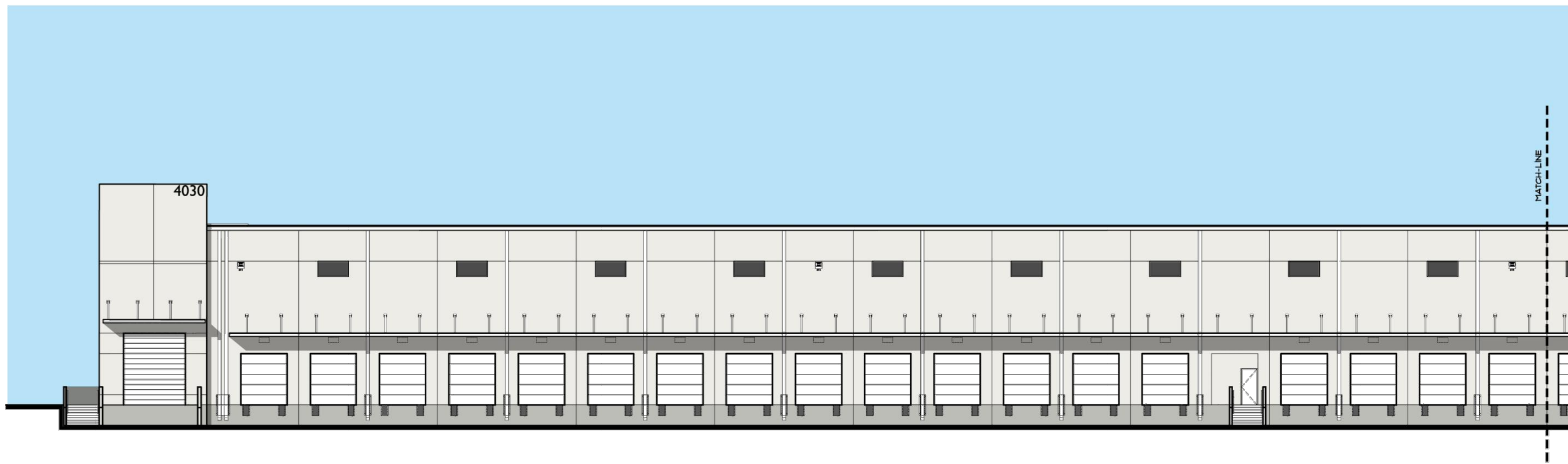
2 PARTIAL EAST ELEVATION A-15 SCALE: 1/16" = 1'-0"