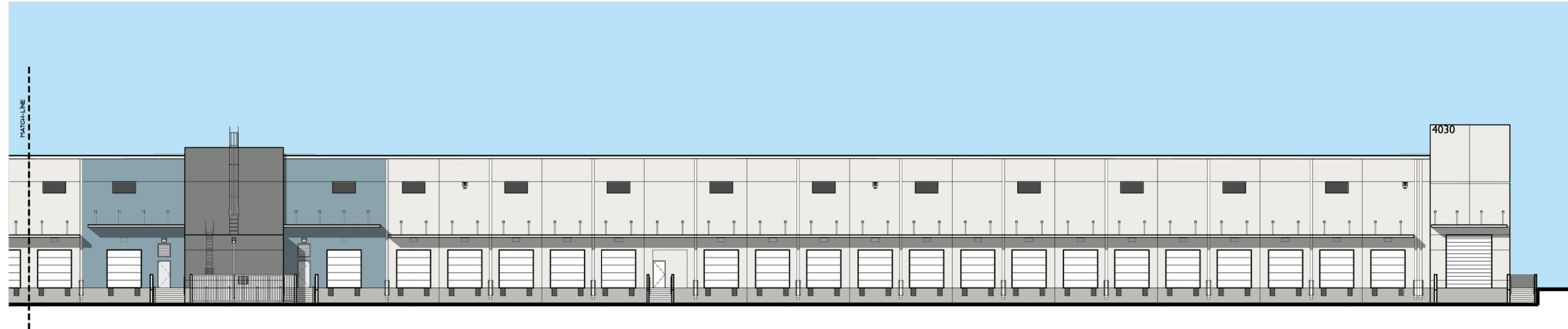
1 PARTIAL EAST ELEVATION A-15 SCALE: 1/16" = 1'-0"