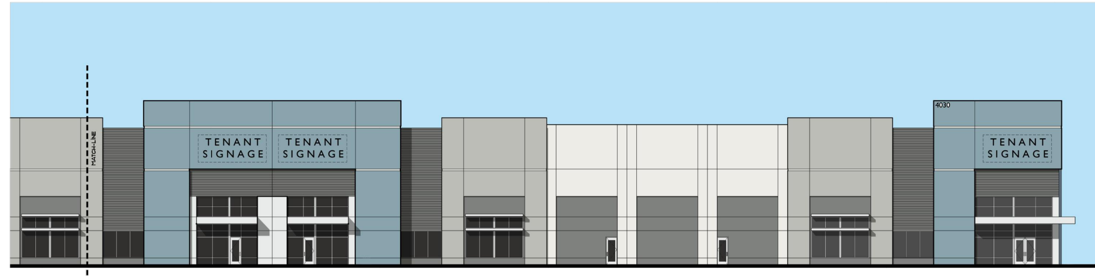
2 PARTIAL WEST ELEVATION A-14 SCALE: 1/16" = 1'-0"