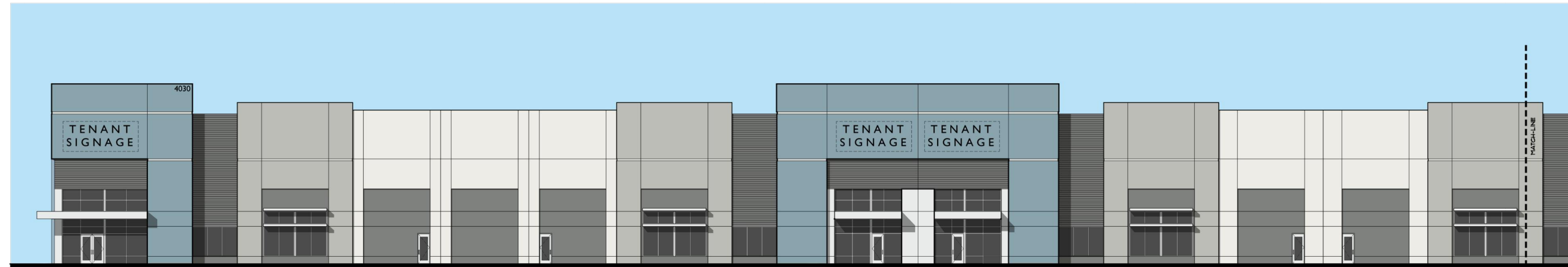
1 PARTIAL WEST ELEVATION A-14 SCALE: 1/16" = 1'-0"