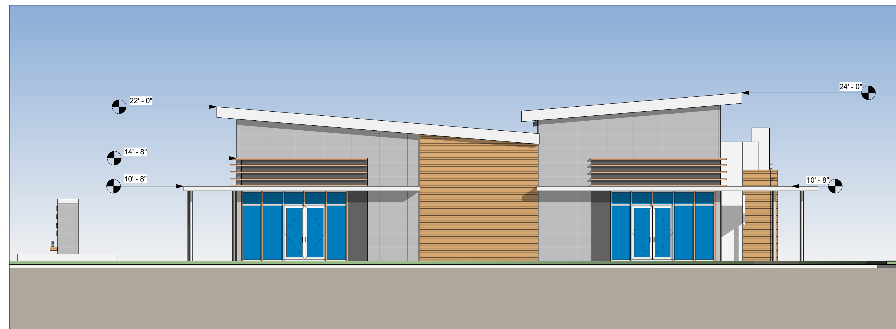
1 EXTERIOR ELEVATION - NORTH 1/8" = 1'-0"