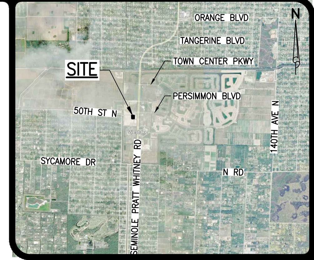
LOCATION MAP NOT TO SCALE