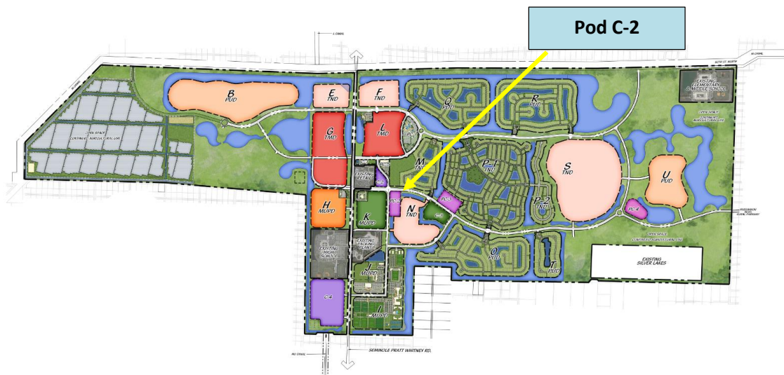
Existing Zoning Map