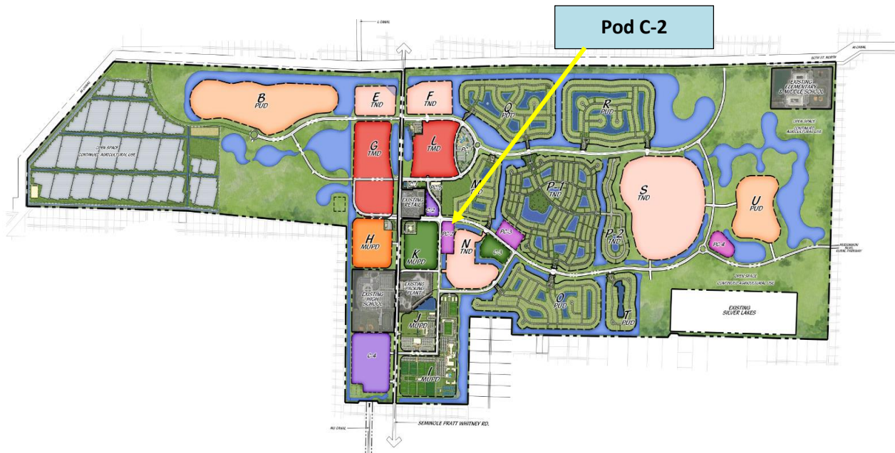
Current Land Use Map