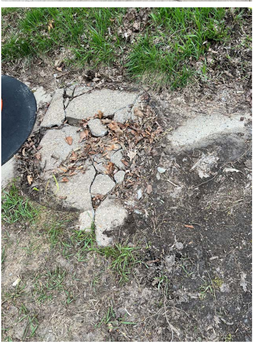
Broken concrete north of Alley entrance