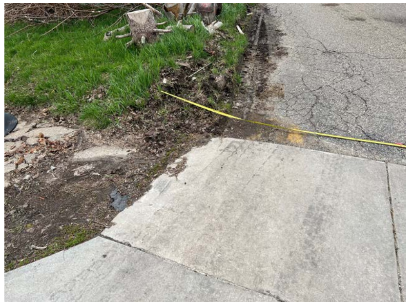
Alley entrance from Ruth Street. Iron placed by Professional Land Surveyor on right side of photo