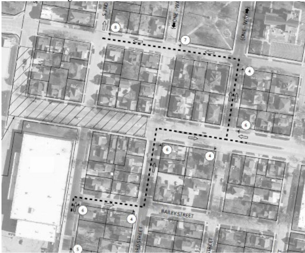
Stage 1 – Southbound Traffic Detour