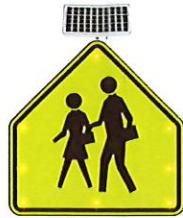
30" School Zone Sign, Solar Powered LED Flashing School Crossing Sign, MUTCD Compl... $899.90