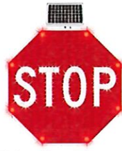
30" Stop Sign, Solar Powered LED Flashing Stop Sign, MUTCD Compliant R1-1, Aluminu... $799.00