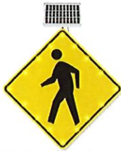
24" Solar Powered Flashing LED Pedestrian Crossing Sign, MUTCD Compliant Blinking P... $899.90