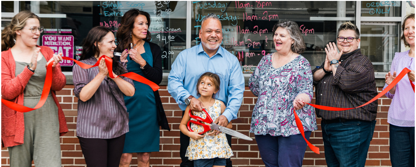
Ribbon cutting at the newly re-opened Schuett's.