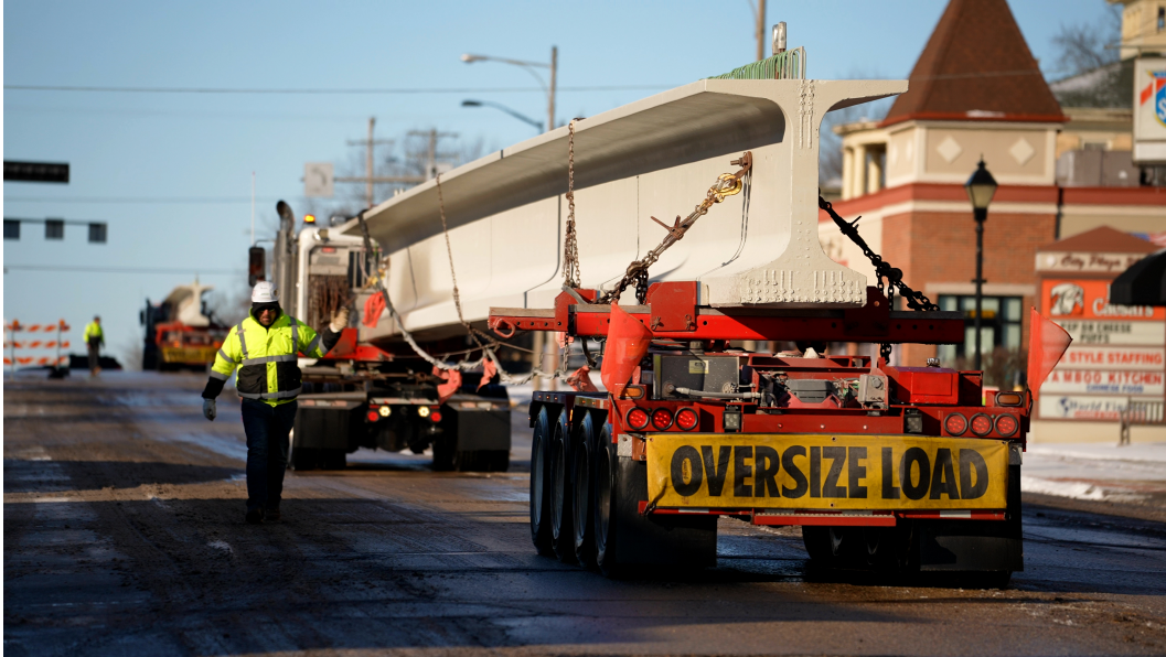
Girders being delivered for the Main Street (Cole) bridge project, January 2025.