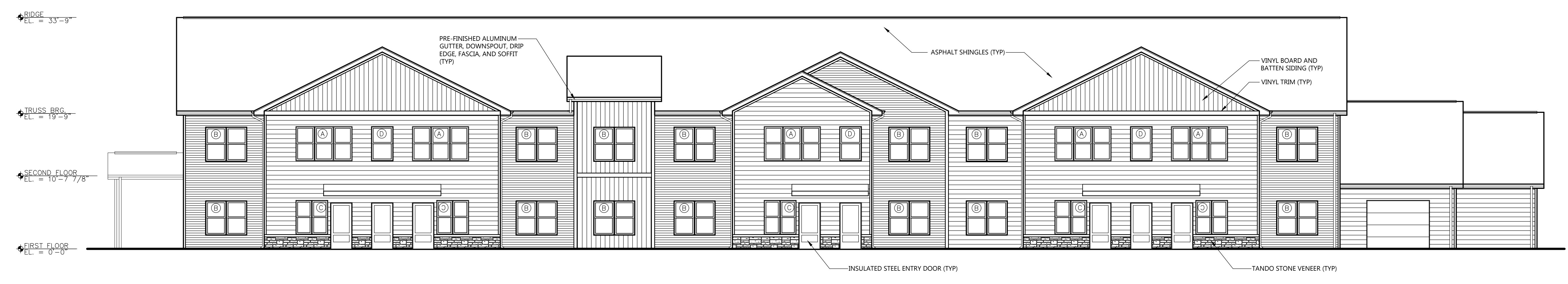
FRONT ELEVATION SCALE: 1/8" = 1'-0"