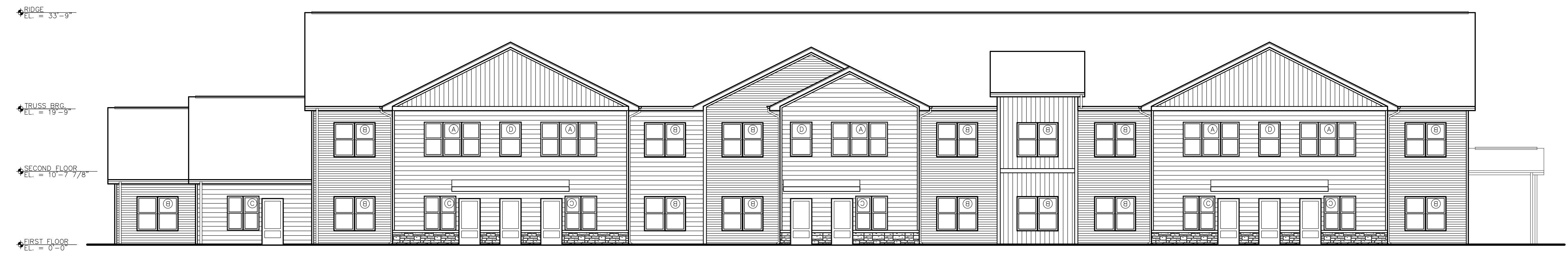
REAR ELEVATION SCALE: 1/8" = 1'-0"