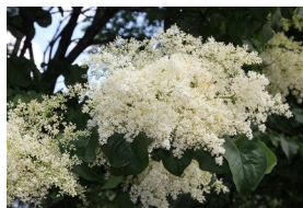
Japanese Tree Lilac

Hackberry Oak London Plane Little Leaf Linden Tulip Tree Turkish Hazelnut Elm Kentucky Coffeetree Ginkgo Maple (limited quantities/species) Honeylocust