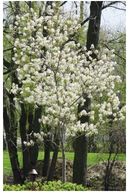
Autumn Brilliance Serviceberry