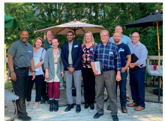
The staff of Madison Region Economic Partnership (MadREP) toured Jefferson County and ended the day with a Conversations with ThriveED networking event.