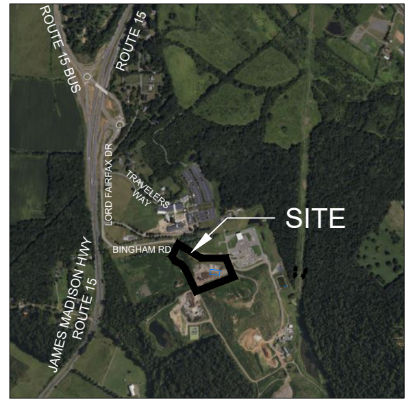
VICINITY MAP SCALE = 1" = 2000'