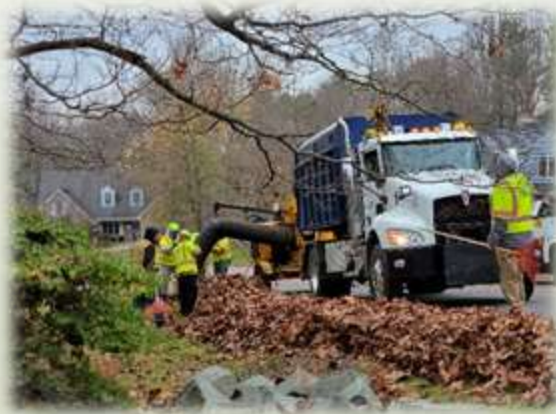
➤ Leaf Collection