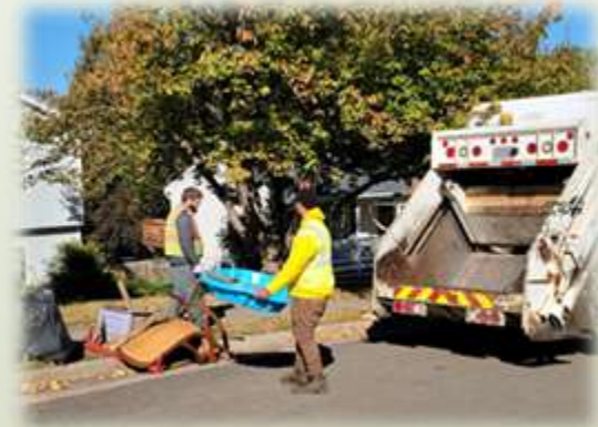
➤ Spring/Fall Clean-up