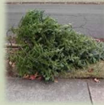
➤ Christmas Tree Collection