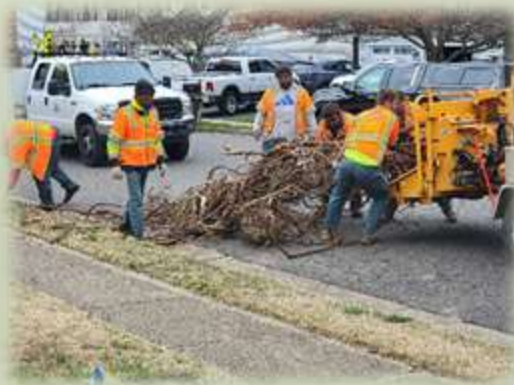
➤ Brush Pick up