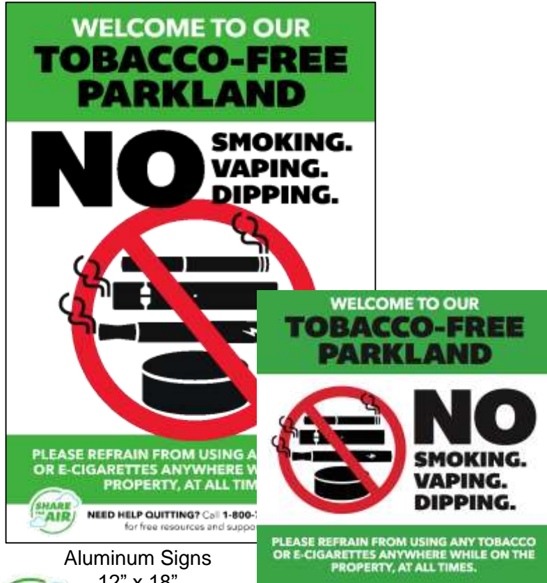
Aluminum Signs 12" x 18"