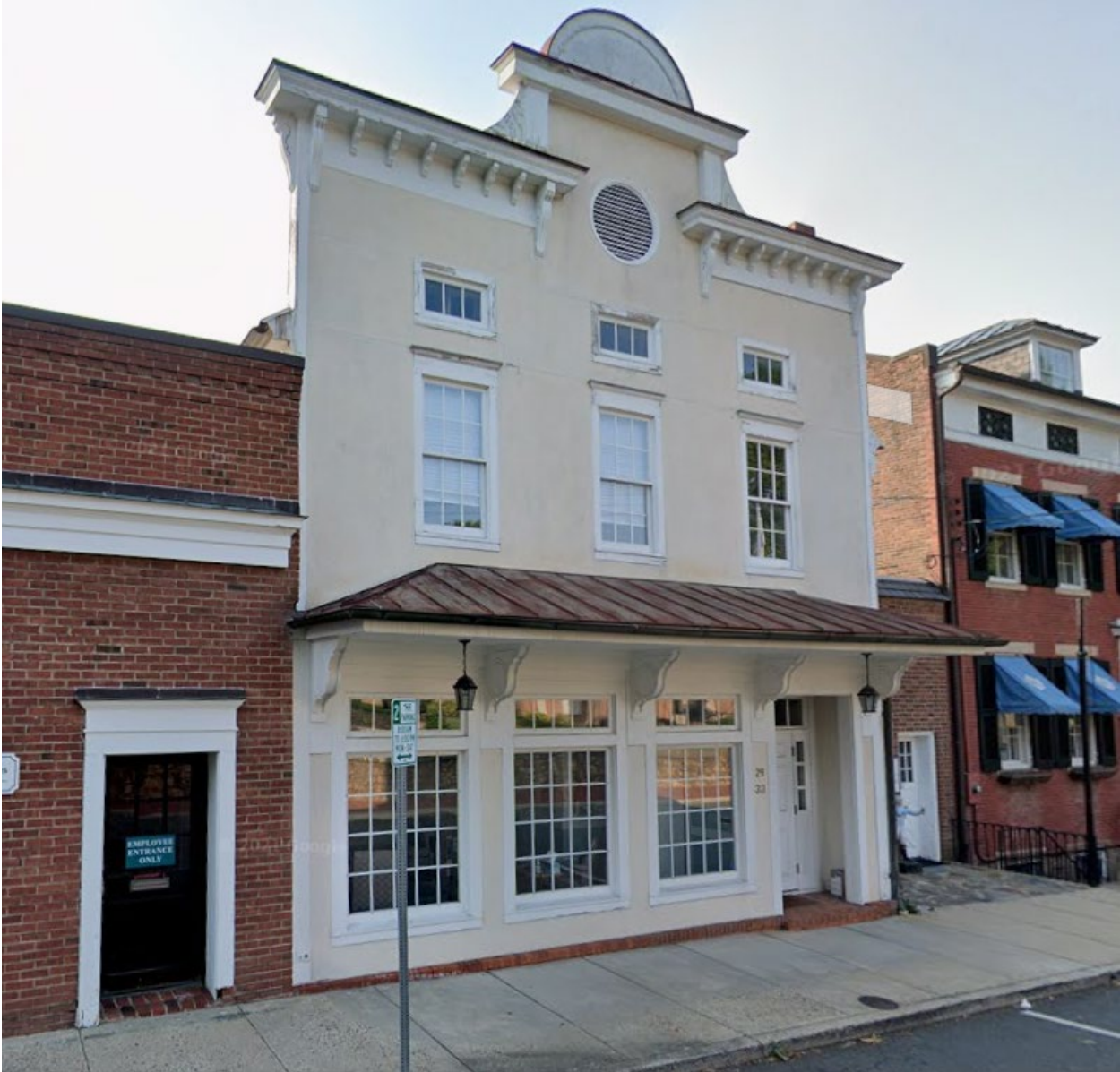
Applicant Photos & Plans: (Please refer to full-scale attachments for high resolution plan set)