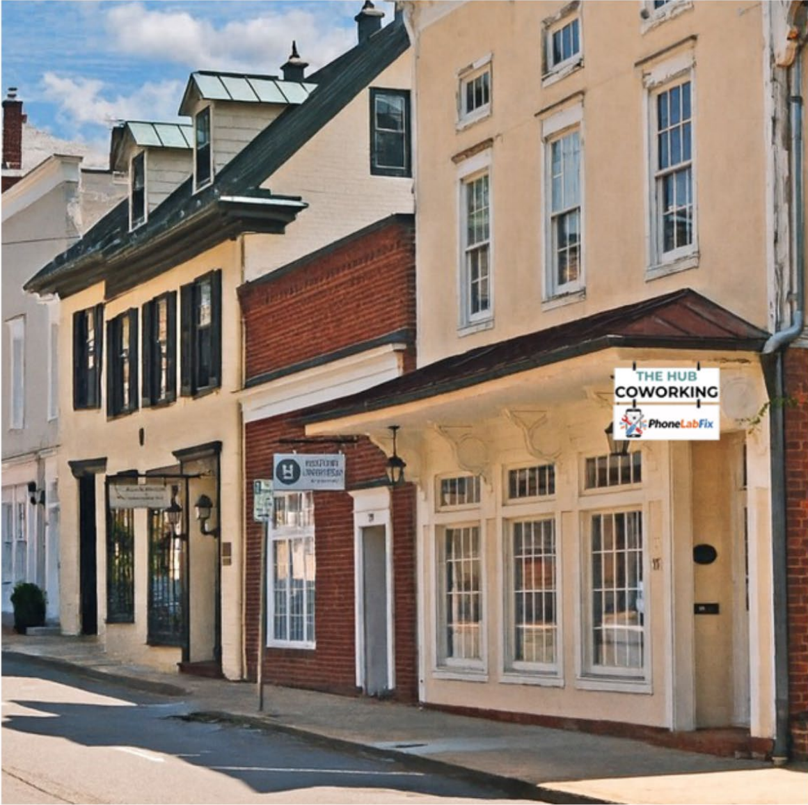
Proposed sign placement Scale approximate