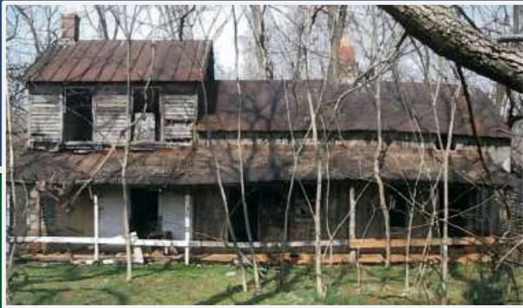
Leeton Forest log house w/two-story additions (ca. 1830 log portion, ca. 1870 & 1920 two-story additions)