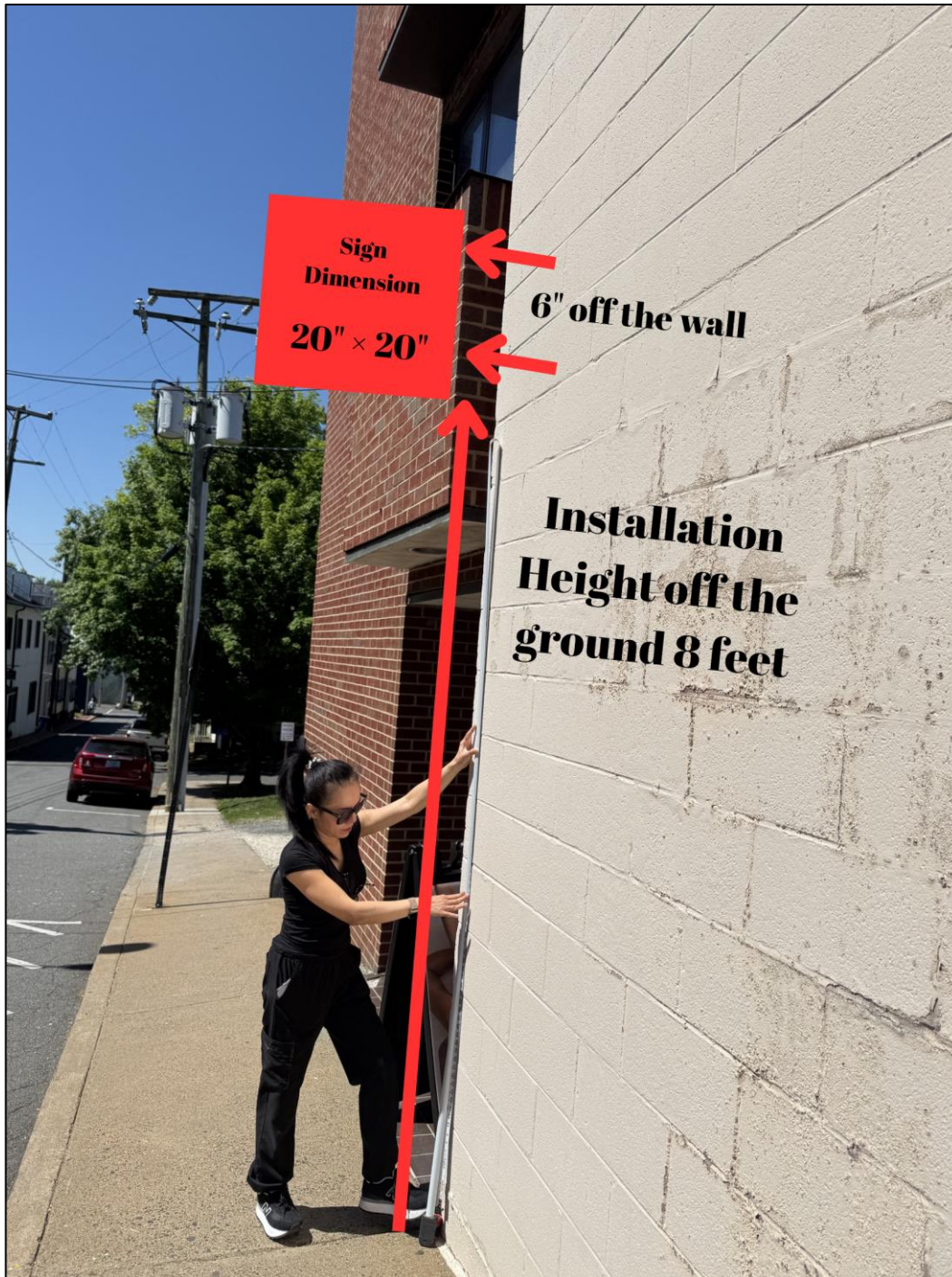
Location and Dimensions of Proposed Signage