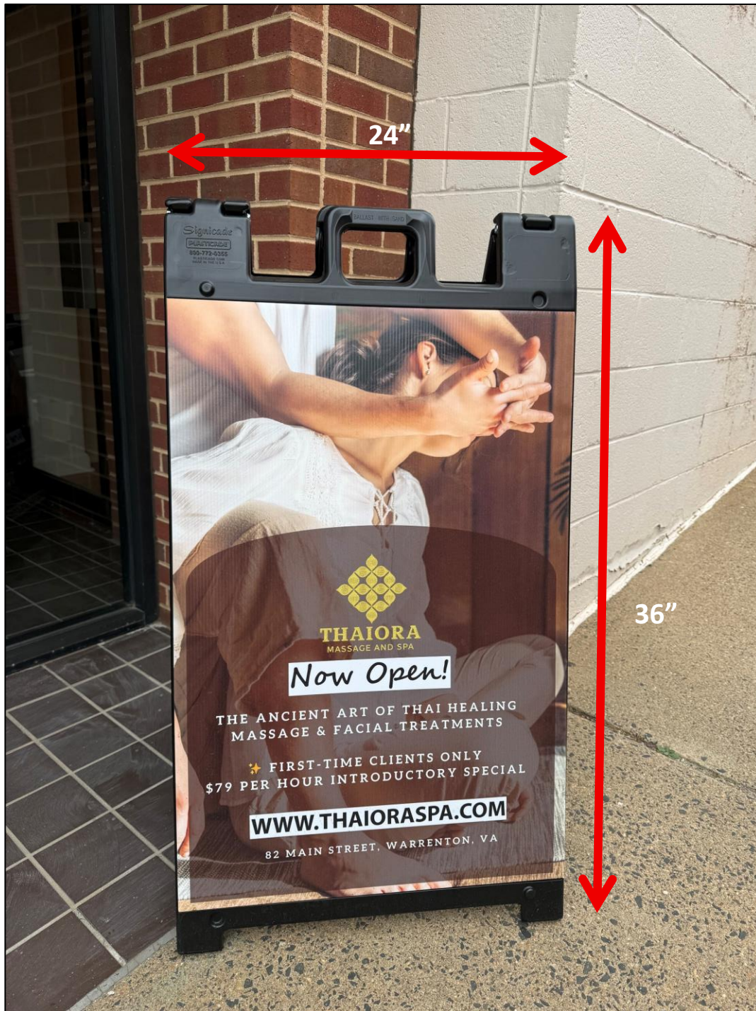
Proposed A-Frame Sidewalk Sign