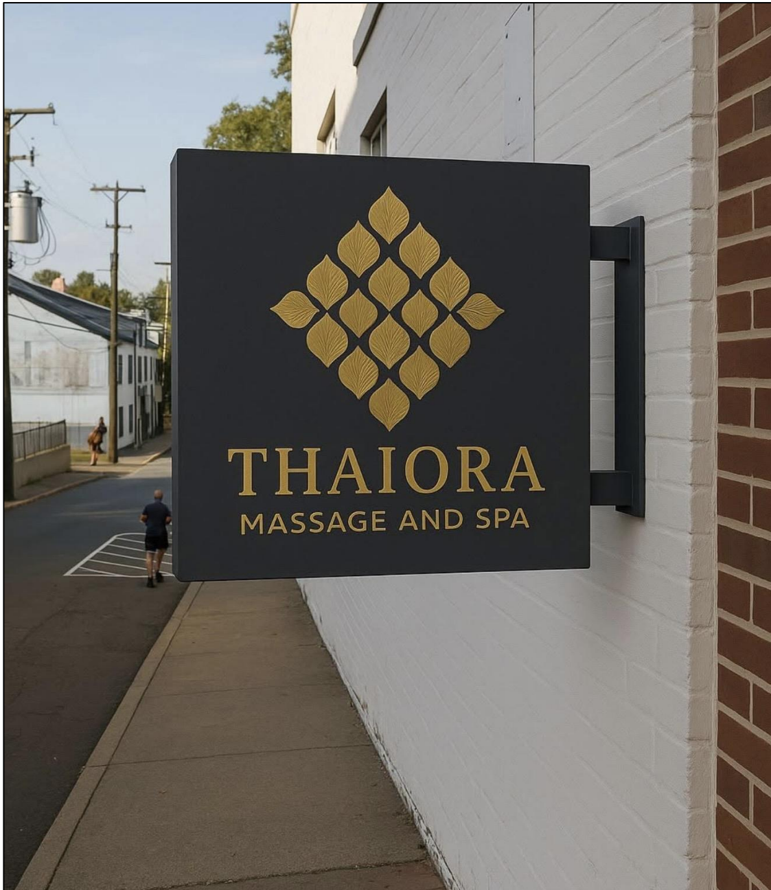
Proposed Business Signage