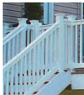
Single Boxed Rail Kits