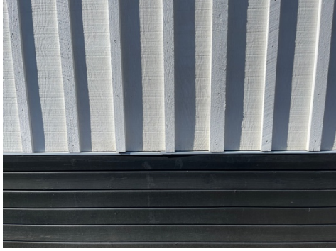
(T-11 with Oak Batten)