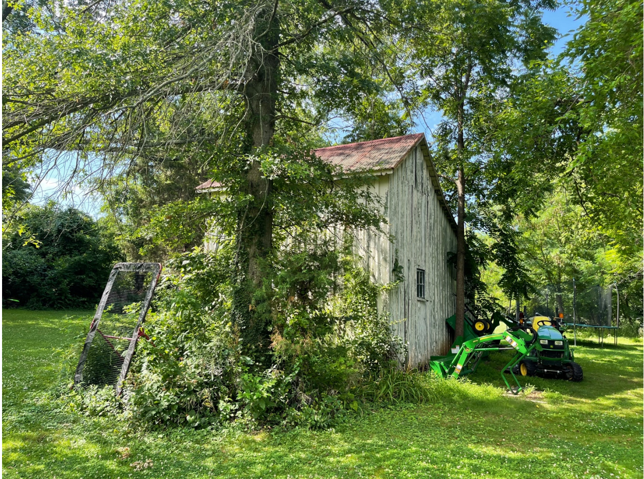
(Existing Barn) Shift building footing to leave room for tree

Siding – Hardie Plank or T-11 with Oak Batten