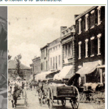
The original 21 Main Street after the facede collapsed during Is recruived Sep. 1974. Image from the Warrendon, Voginal book by Toler, Shepherd, & Power.

Legend Local & National Historic District